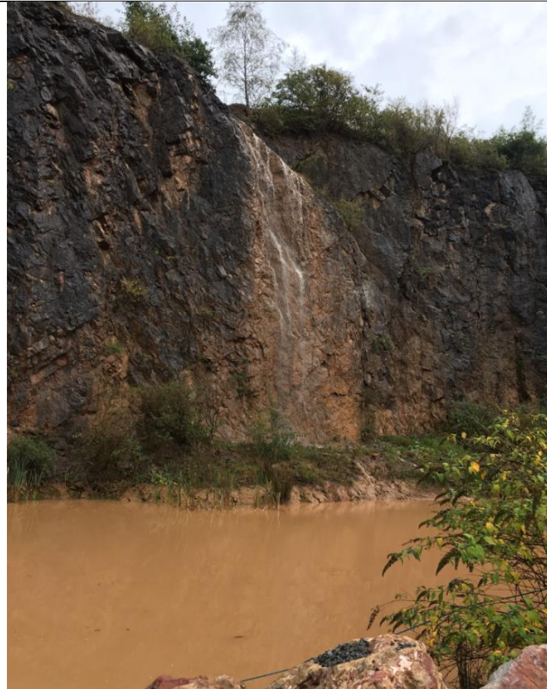
Closer view of the same