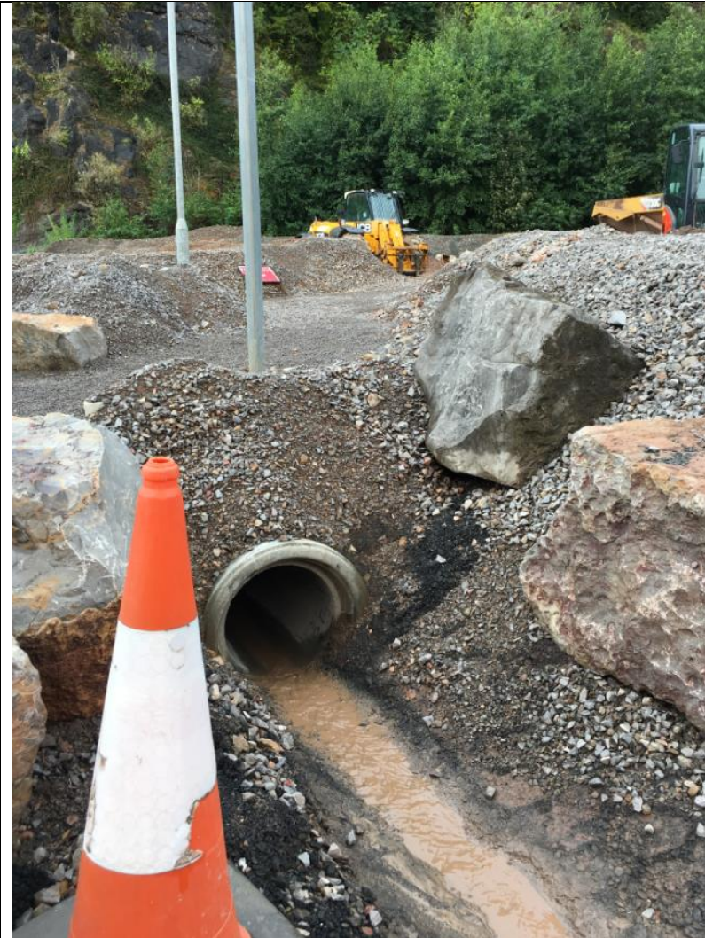
Surface water runoff from operational site entering the Secondary Settlement Lagoons via culvert beneath the road.