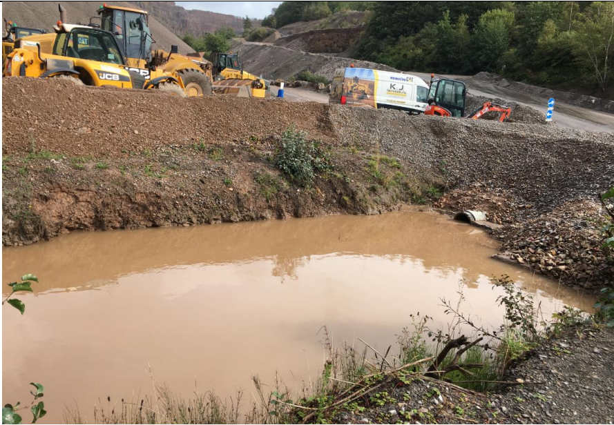
Secondary Settlement Lagoons