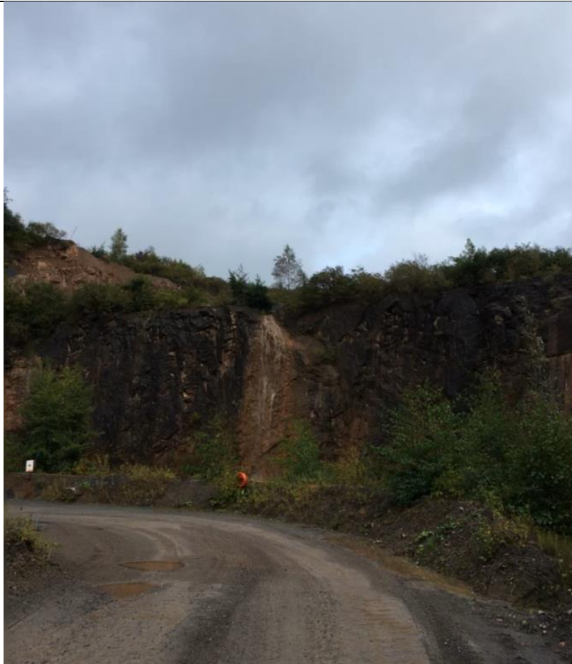
View from site haul road looking north at the cliff face overtopping the Primary Settlement Lagoon