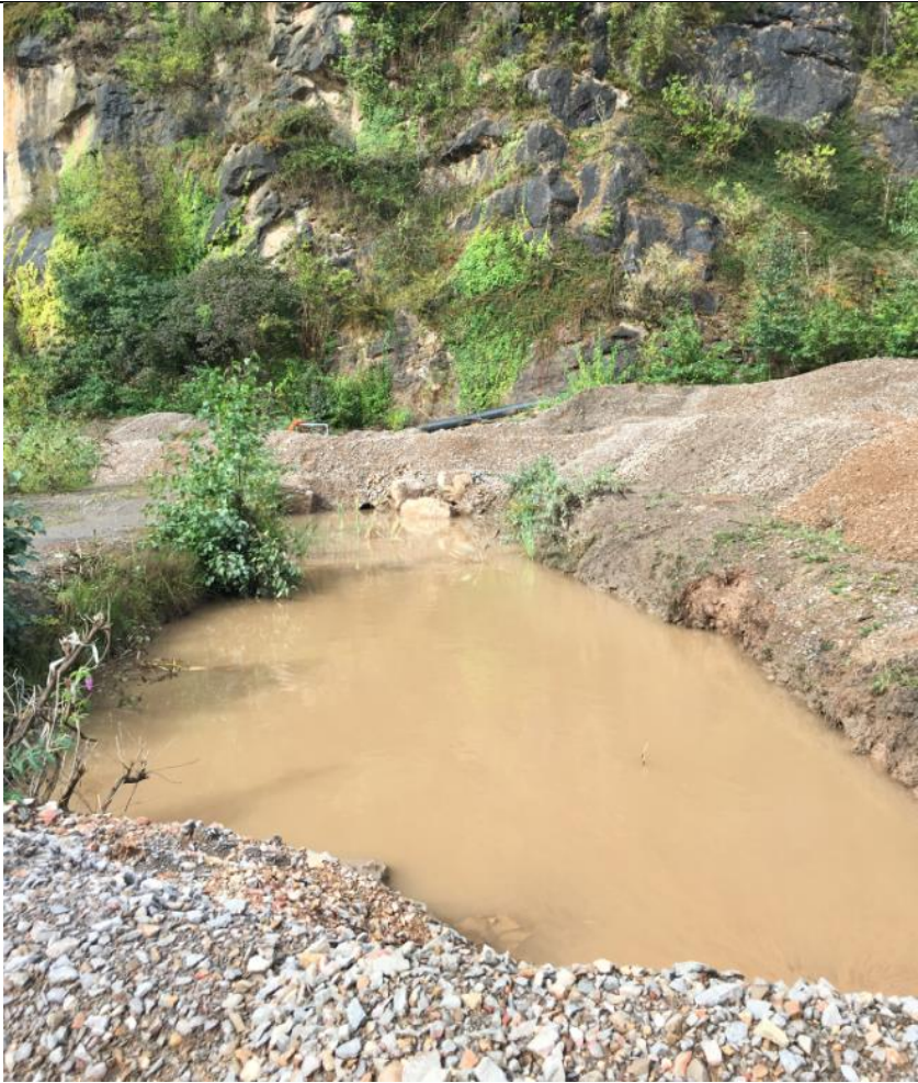
Secondary Settlement Lagoons