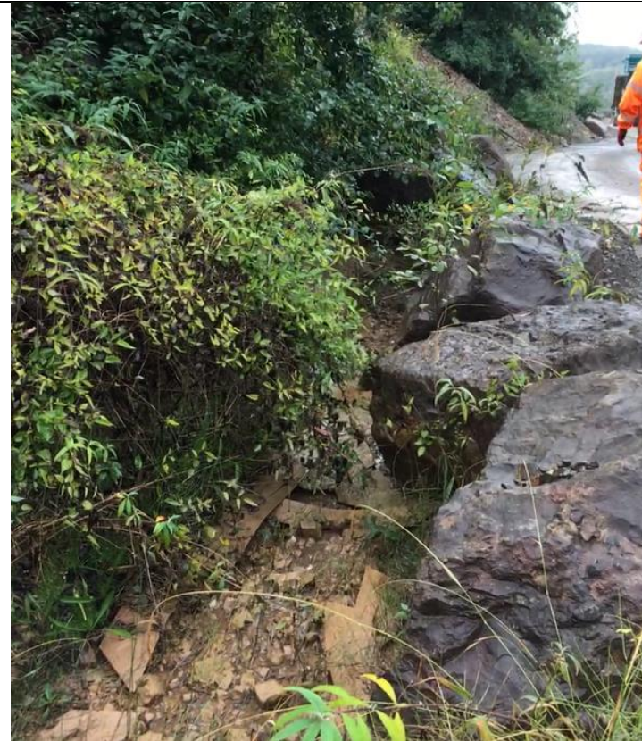
Beginnings of culverted overflow path to Secondary Settlement Lagoons (looking east south east)