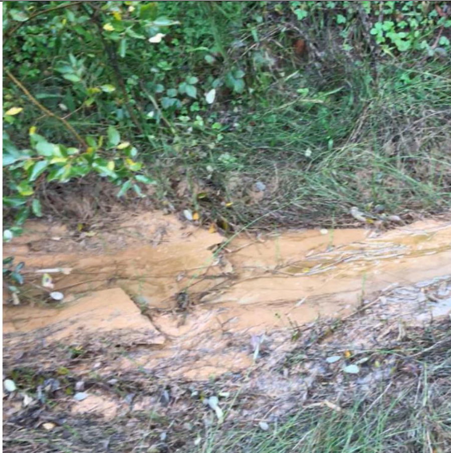
Beginnings of overflow channel taking overflow (turbid) water from the Primary Settlement Lagoon to the Secondary Settlement Lagoons (looking east)