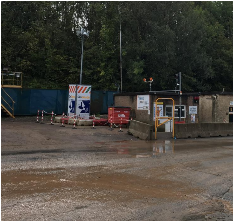
Water runoff from clean site areas to Secondary Settlement Lagoons (looking east)