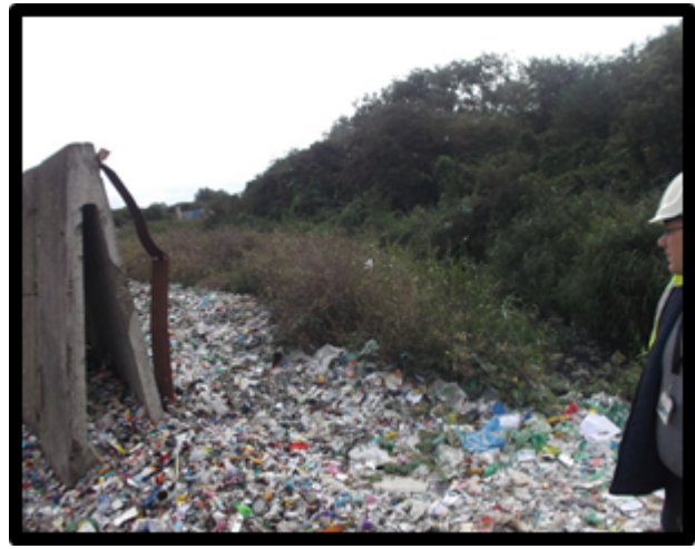
Pictures 1 (a) and (b) – showing litter blown into the vegetation and in the reën