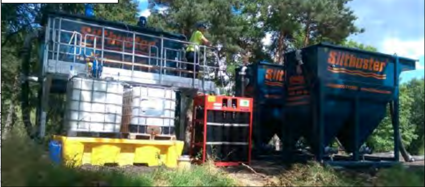
Typical Example Set Up

Either replace existing reptile fence or install a short section of silt fence to tie into the reptile fence