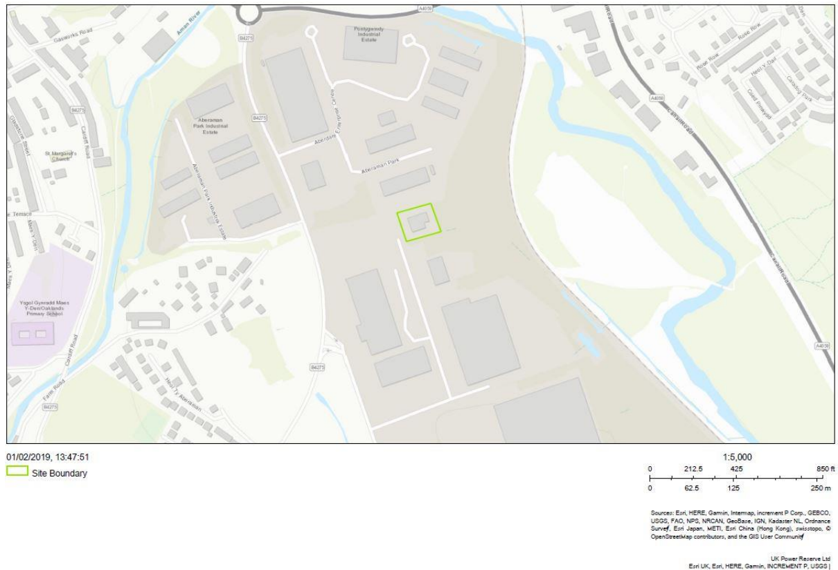
Figure 1: Location Plan