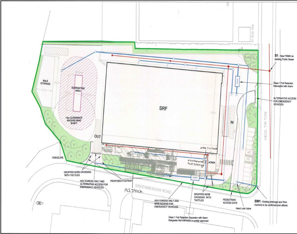
Figure 1: Site Layout