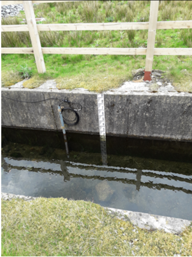
Llyn Bodlyn Rating Graph for Compensation Flow