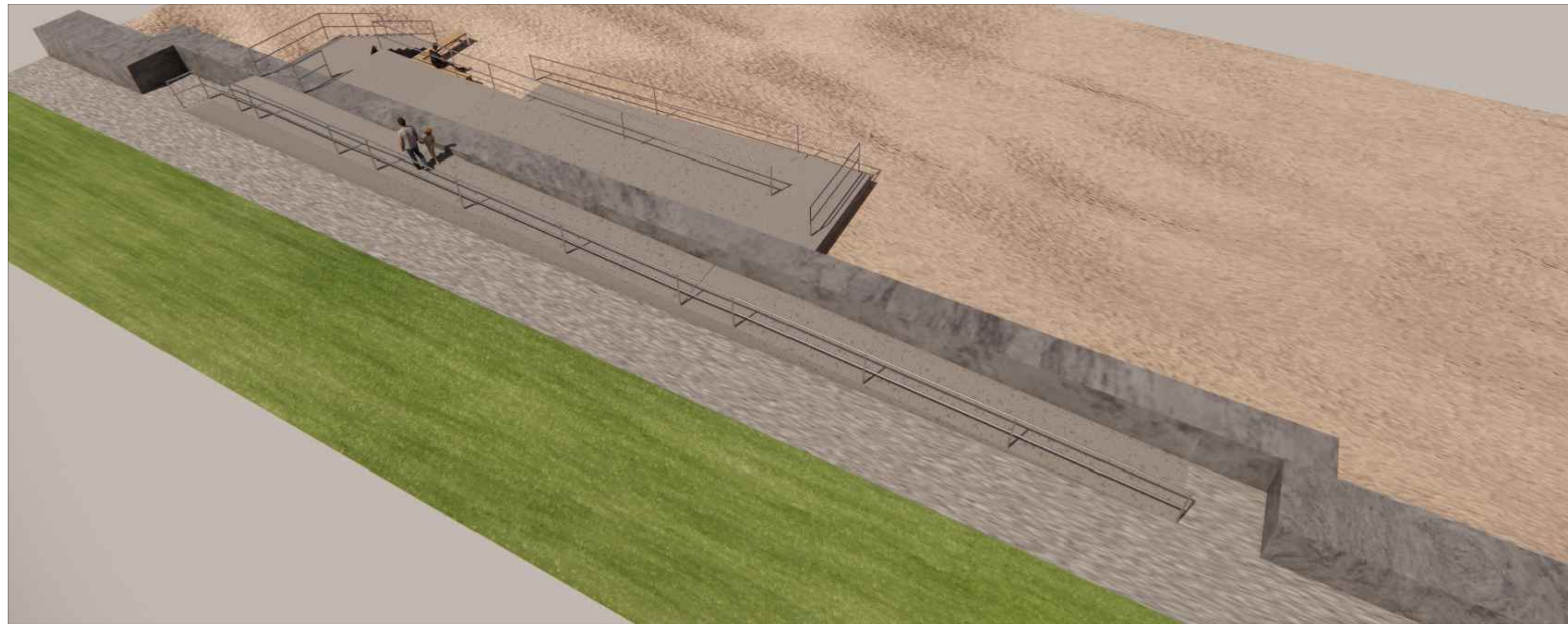
2203 03 Illustrative Axonometric View NTS