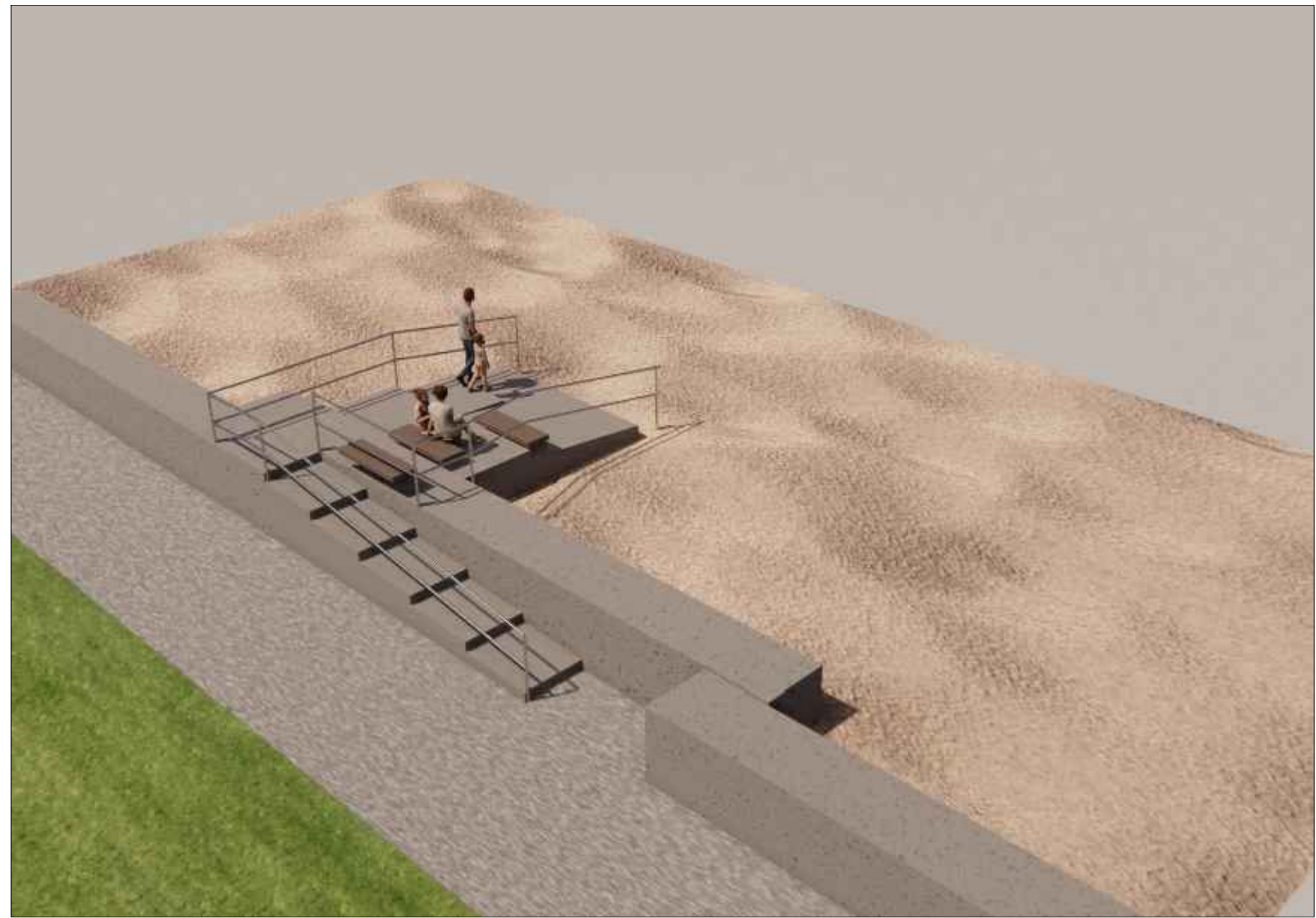
2207 03 Illustrative Axonometric View NTS