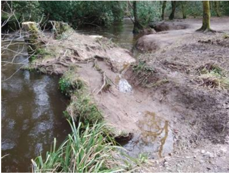
Figure 25. SS 62450 97495 Erosion on RHB from impounded flows redirecting in high flows.