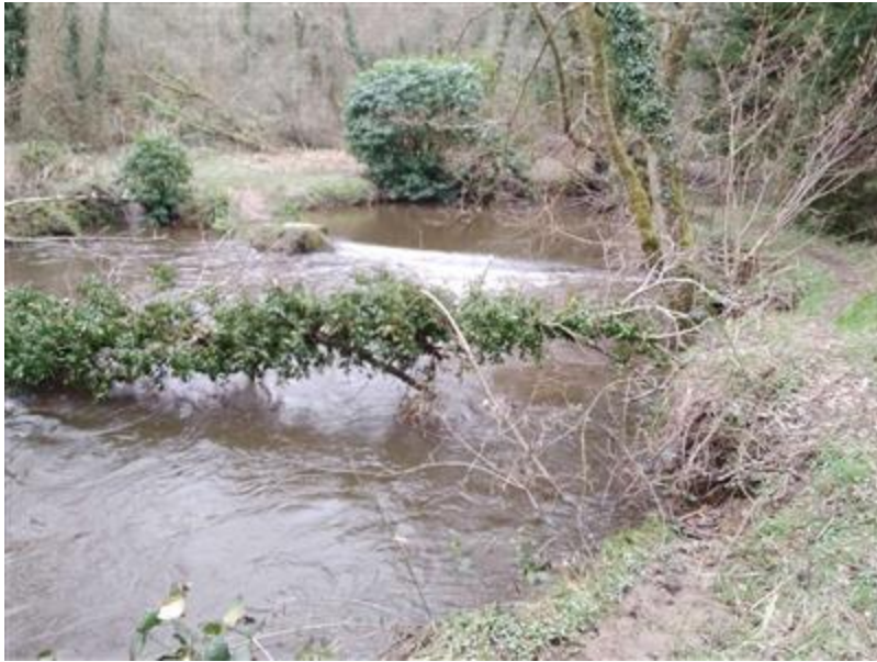
Figure 9. SS 62469 97686 weir facing US from LHB.