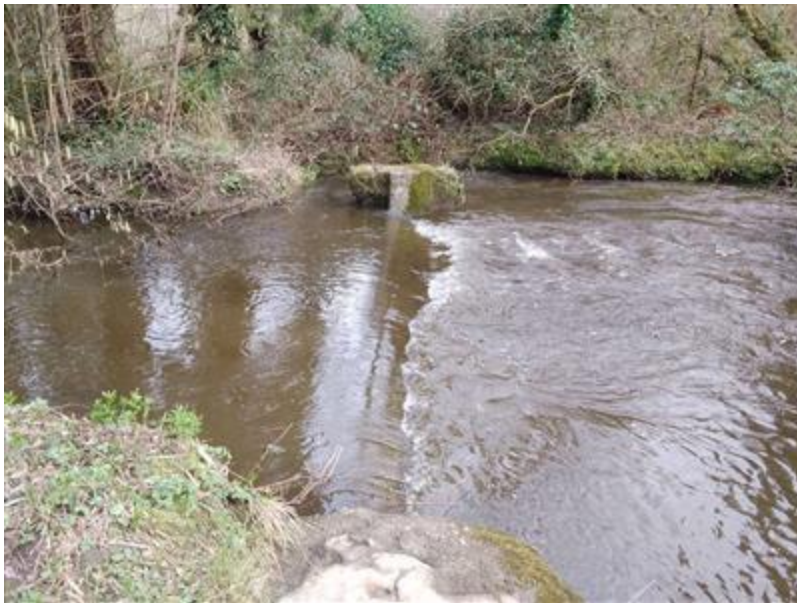
Figure 18. SS 62440 97566 middle weir from RHB.