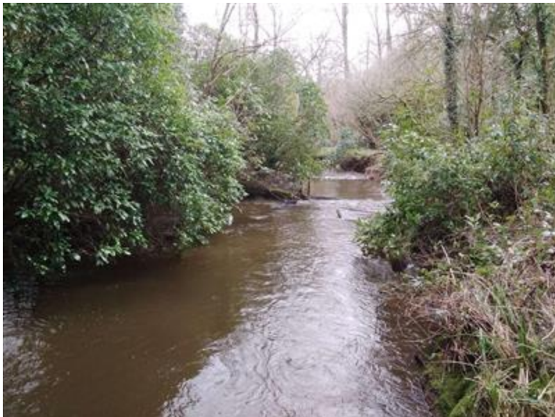
Figure 34. SS 62457 97471 Channel DS of weir - tree lined either side.