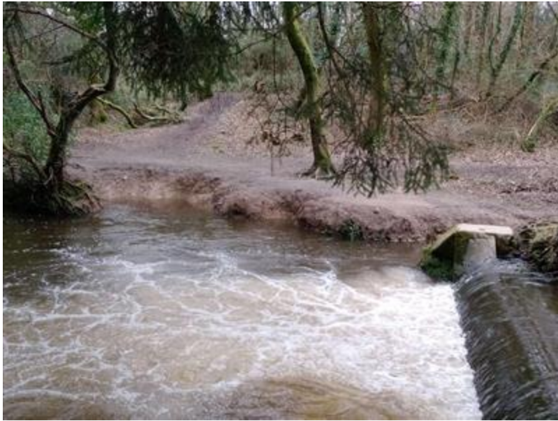
Figure 29. SS 62458 97491 RHB bank erosion viewed from LHB.