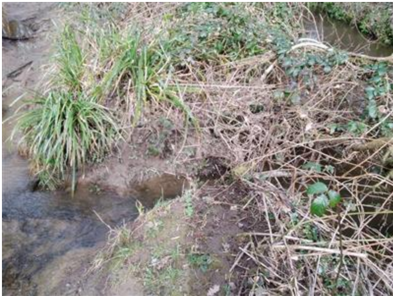
Figure 24. SS 62447 97500 Flow pathway enters RHB.