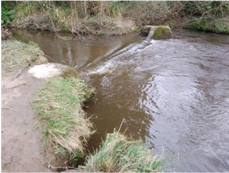
Figure 17. SS 62442 97559 view from DS weir RHB facing US.