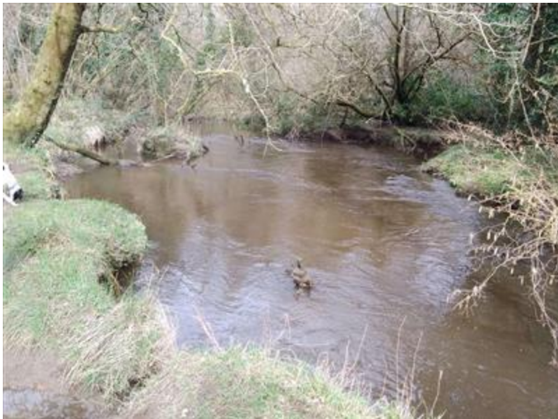
Figure 16. SS 62445 97576 photo facing US from RHB.