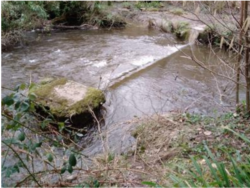
Figure 21. SS 62440 97559 Weir from LHB facing DS. Note current breach on LHB.