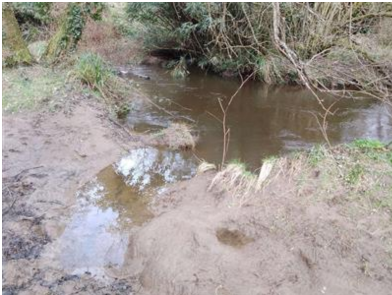
Figure 12. SS 62428 97641 facing US from RHB vegetated tree lined channel. Some dog erosion.