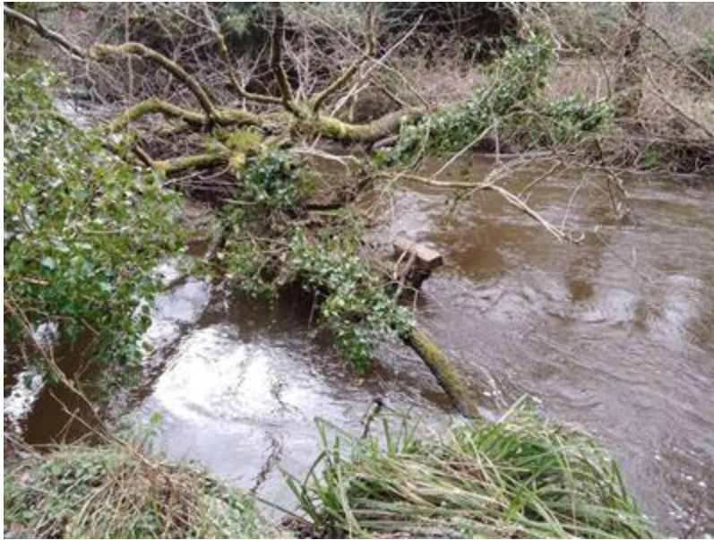
Figure 11. SS 62465 97669 eddy on LHB - Taken from LHB facing DS.