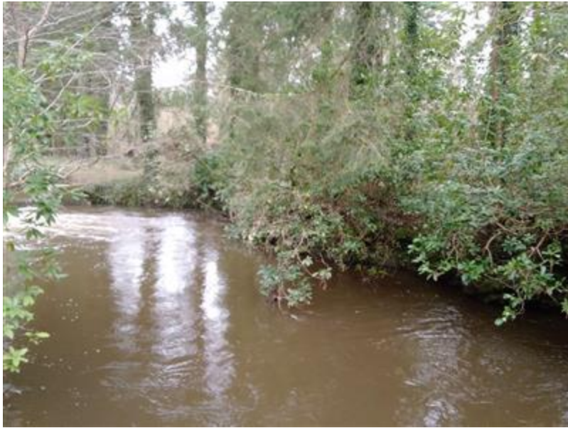
Figure 33. SS 62451 97482 Tree lined RHB DS of weir.