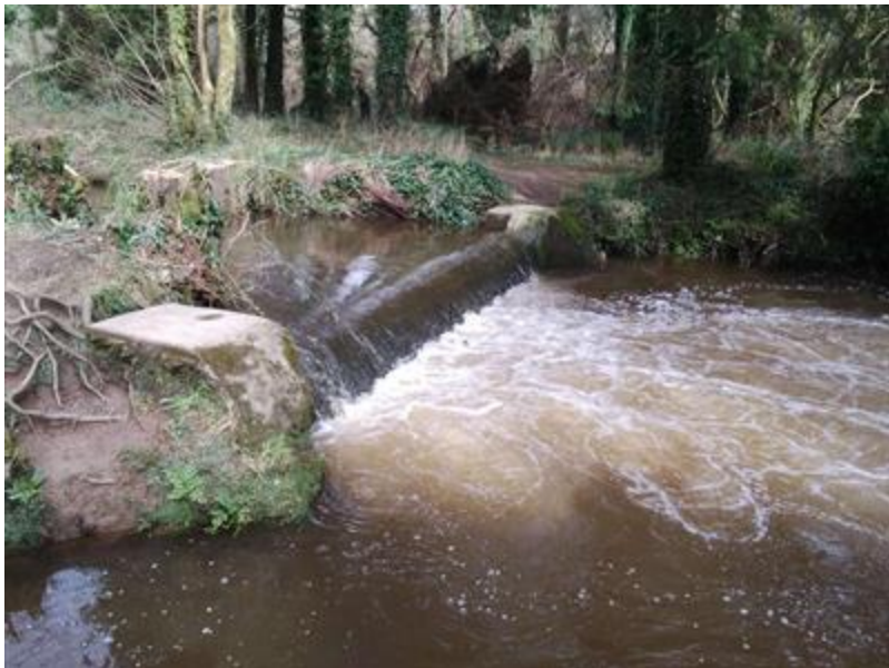
Figure 30. SS 62460 97491 Immediately DS weir from RHB.