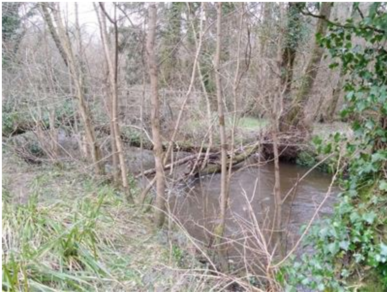
Figure 6. SS 62448 976996 facing US from RHB.