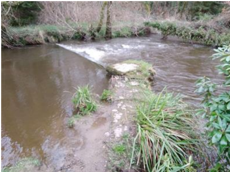
Figure 8. SS 62450 97698 weir and gabion baskets from RHB.