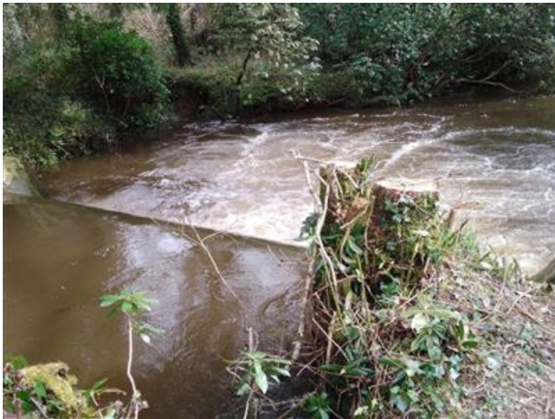
Figure 28. SS 62454 97493 Immediately US weir from RHB.