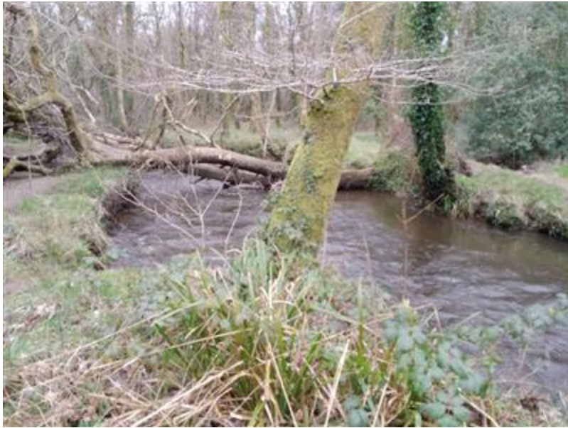
Figure 1. SS 62448 97780 facing US from RHB.