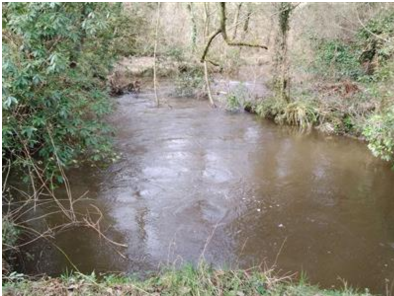
Figure 20. SS 62452 97525 Facing US from RHB.