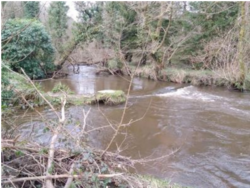
Figure 10. SS 62457 97695 DS of weir facing US from RHB.