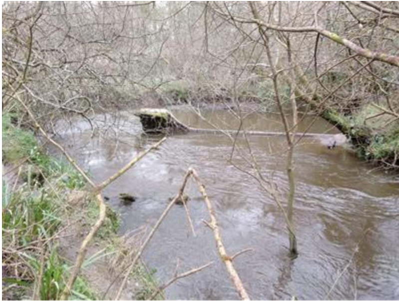
Figure 37. SS 62459 97475 Weir to be left viewed from LHB facing DS.