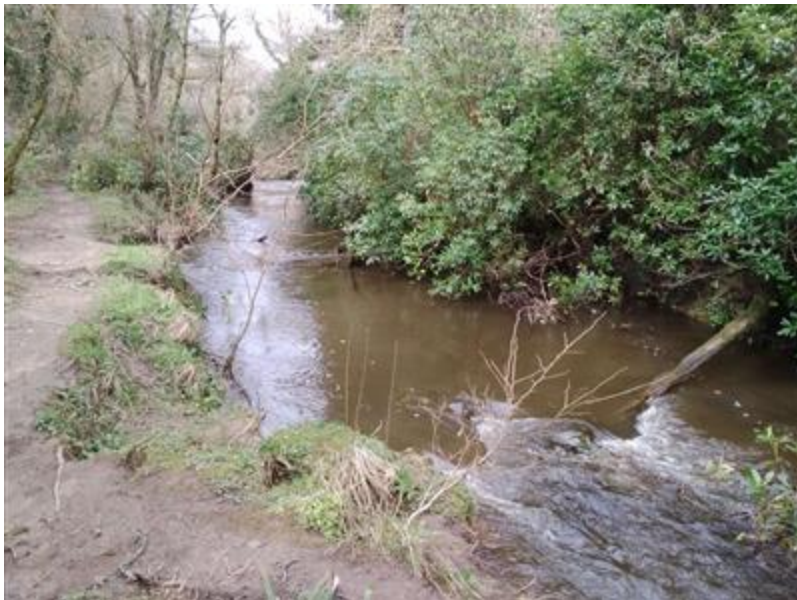
Figure 36. SS 62476 97440 Facing US from RHB.