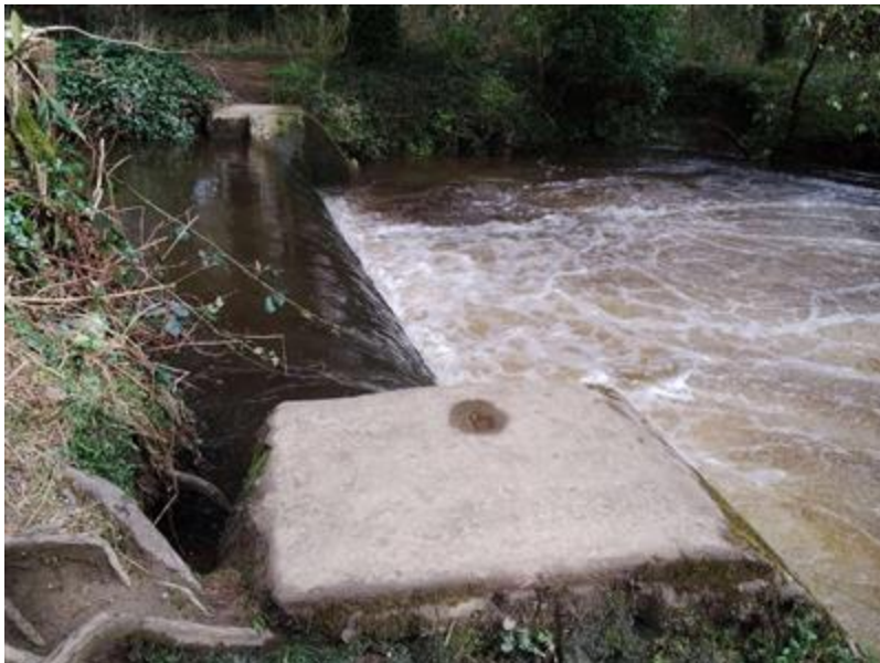
Figure 32. SS 62452 97478 Weir from RHB.