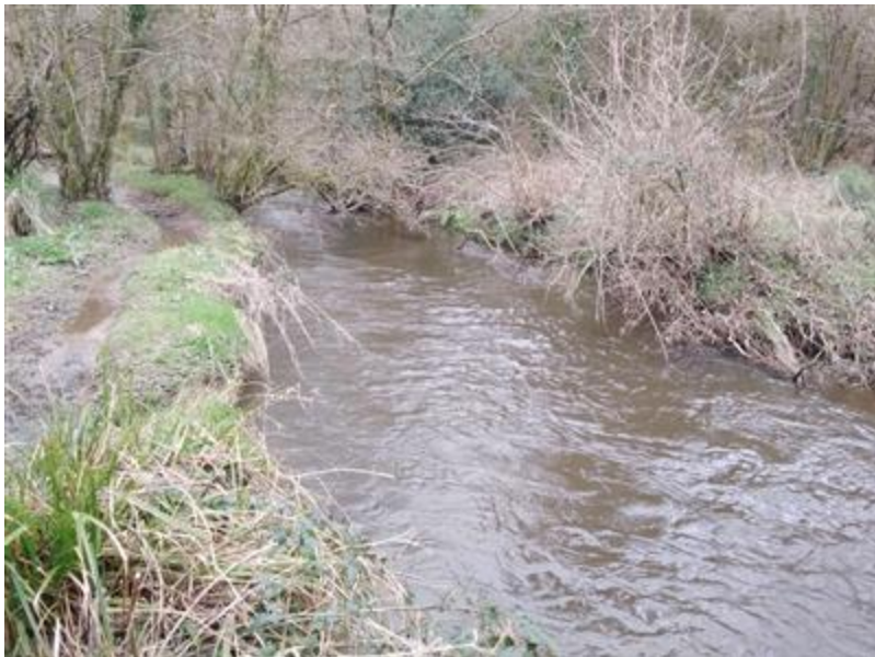
Figure 2. SS 62444 97737 facing US from RHB.