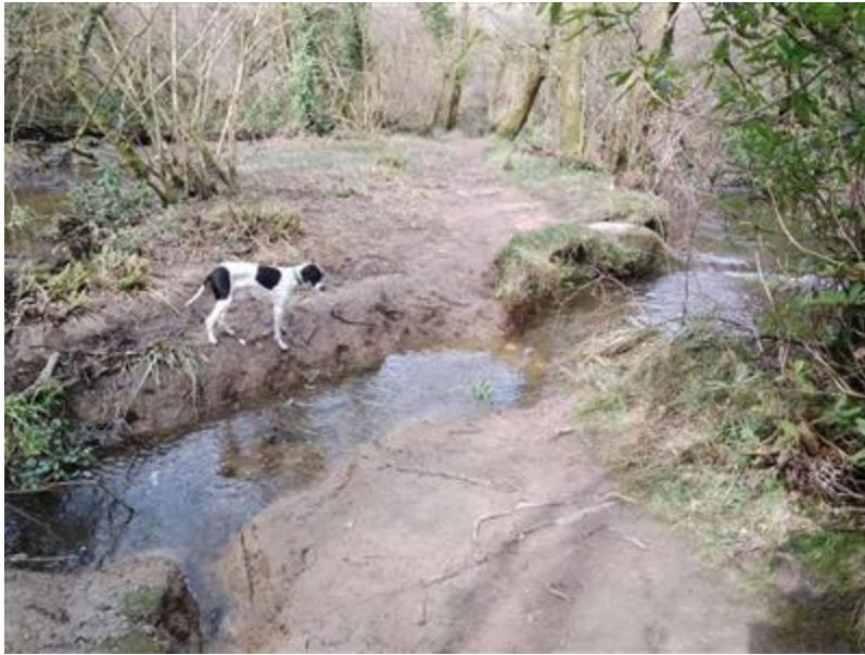
Figure 19. ss 62447 97535 surface water runoff enters river below weir.