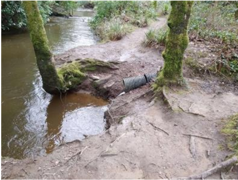
Figure 31. SS 62466 97477 Bank erosion and surface water inlet (NB. above NGR is photo location, inlet at SS 62457 97473).