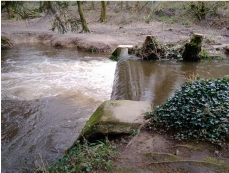
Figure 27. SS 62458 97486 Weir from LHB.