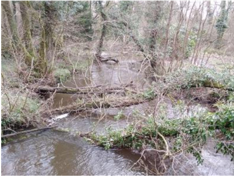
Figure 5. SS 62471 97703 DS from footbridge.