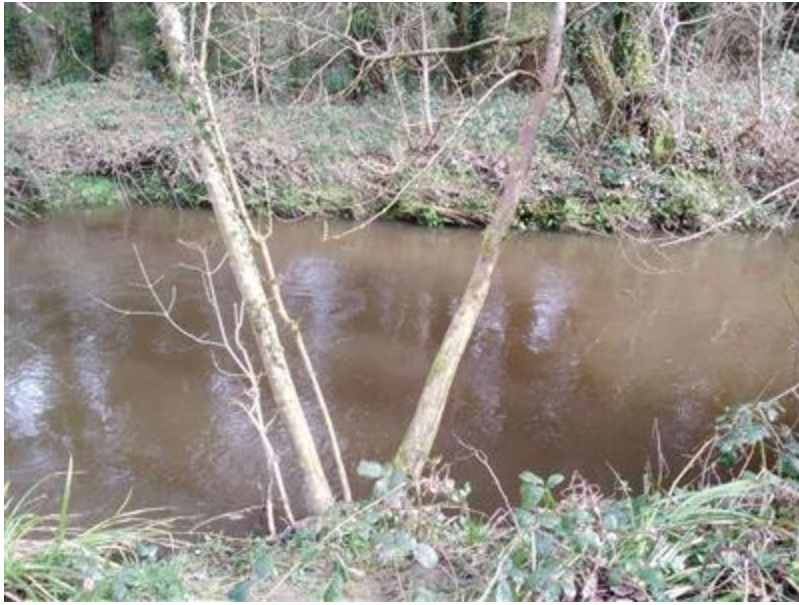
Figure 23. SS 62450 97518 LHB view from RHB.