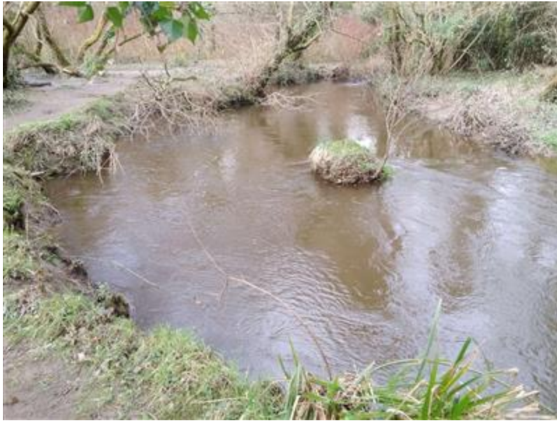
Figure 13. SS 62456 97615 facing US from the RHB.