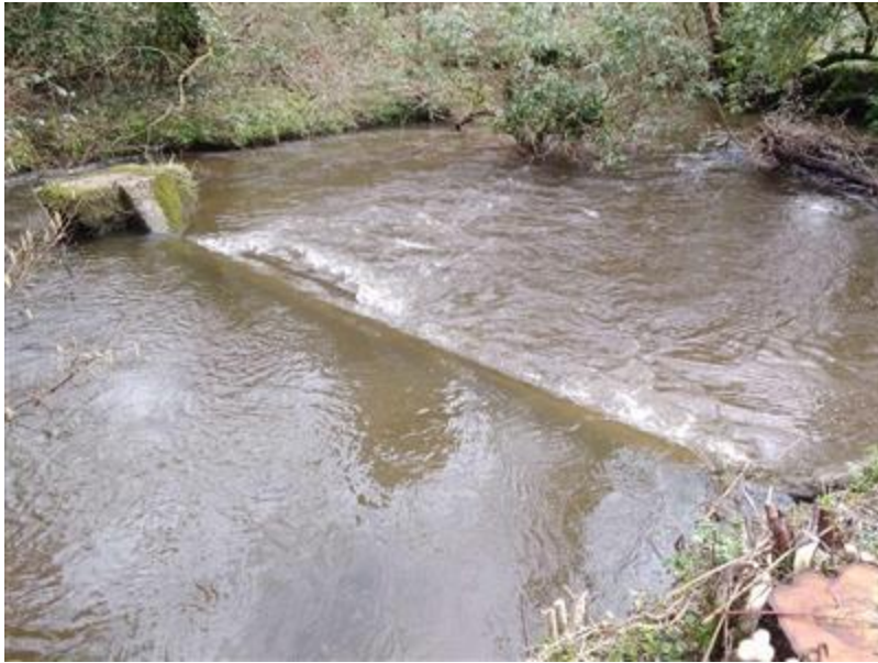
Figure 15. SS 62443 97565 view from US weir RHB facing DS.