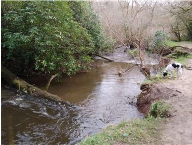
Figure 35. SS 62479 97443 LWM in channel. Some bank erosion on RHB from dog entry. Photo from RHB.