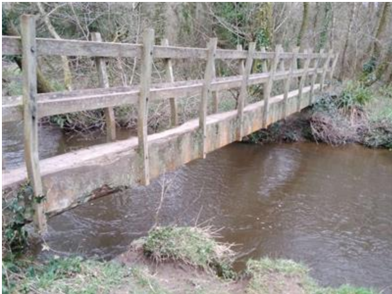
Figure 4. Footbridge at SS 62451 97729 from RHB at SS 62449 97725.