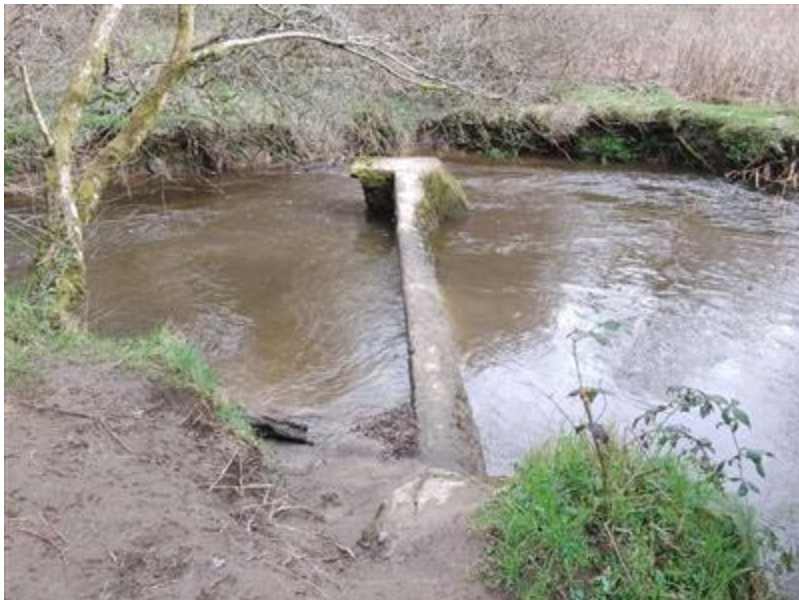
Figure 38. SS 62495 97436 Further weir breached on LHB. No works being carried out on this weir.