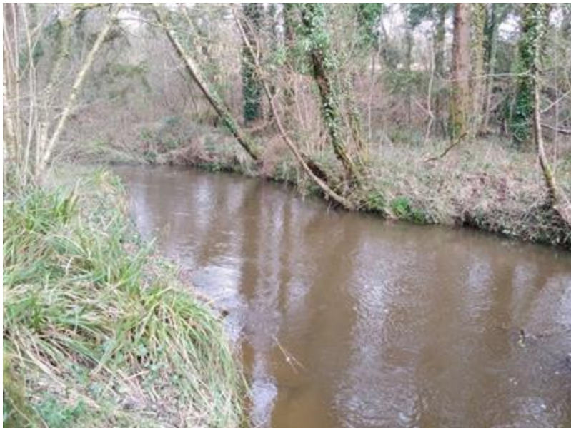
Figure 22. SS 62451 97523 Facing US from RHB.