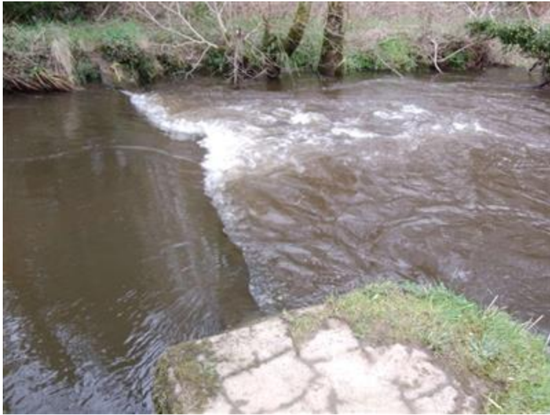
Figure 7. SS 62454 97699 - photo from RHB pillar facing LHB.