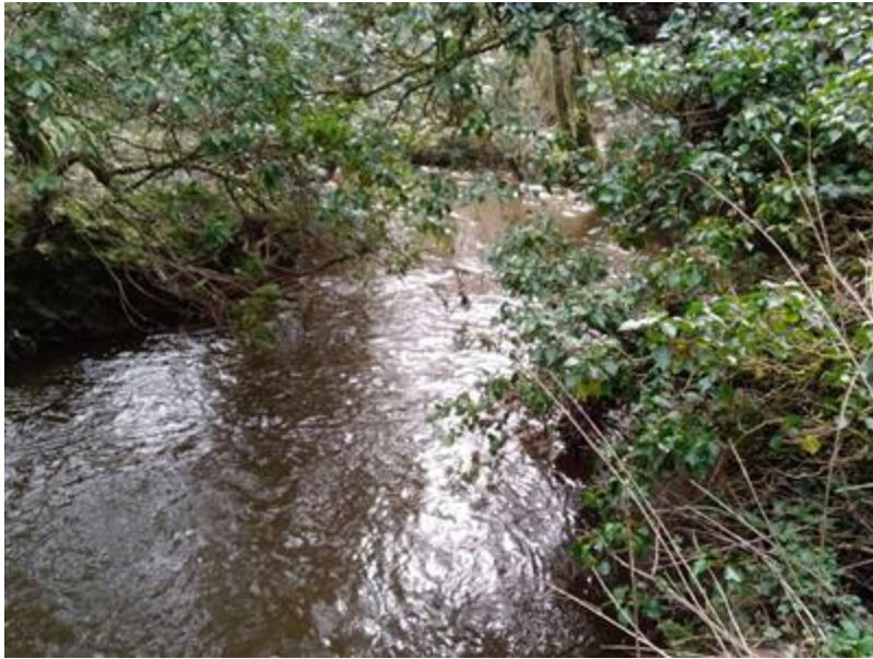
Figure 39. SS 62475 97417 Both banks vegetated and tree lined.