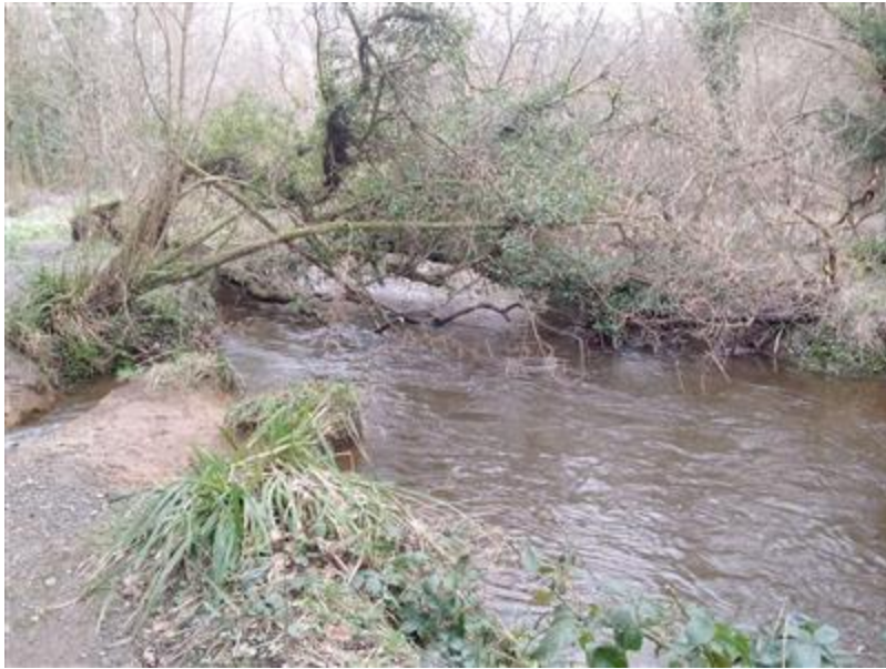
Figure 3. SS 62444 97732 facing US from RHB.