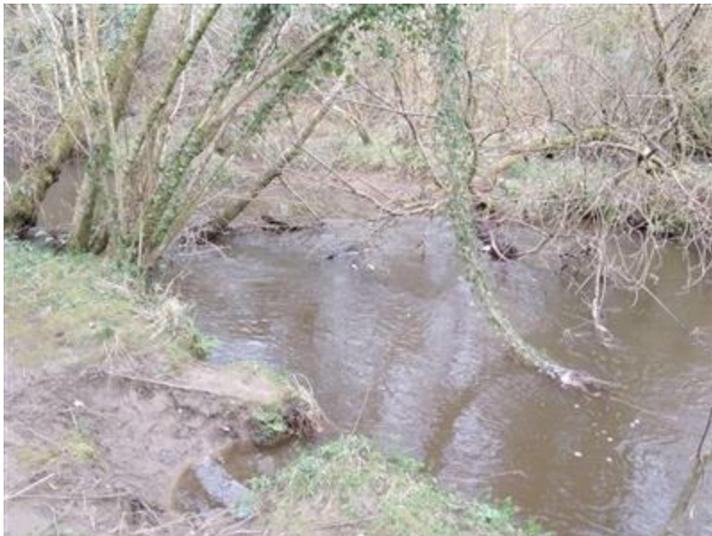
Figure 14. SS 62448 97587 photo facing US from RHB. Tree lined channel, some erosion from dog access.