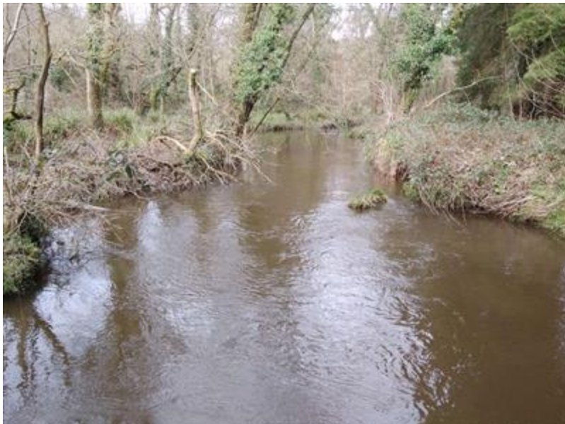
Figure 26. SS62474 97501 Facing US from RHB.