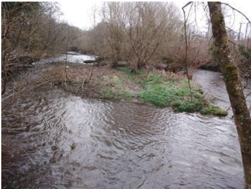
Figure 2. SN 62104 10742 Channel facing US from RHB. Island, channel remains tree lined.