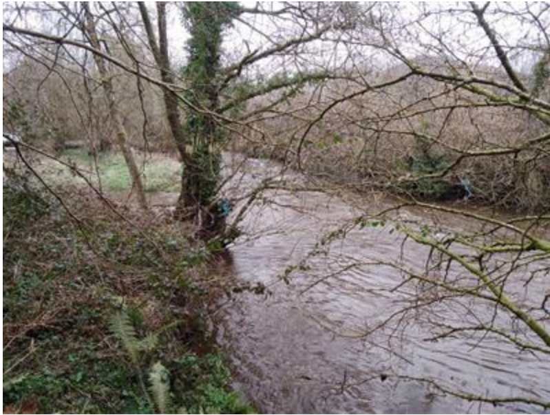
Figure 3. SN 62114 10744 Channel facing US from RHB.