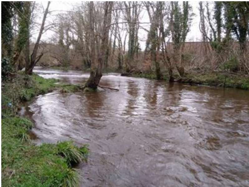
Figure 20. SN 62191 10672 Channel facing US from RHB.