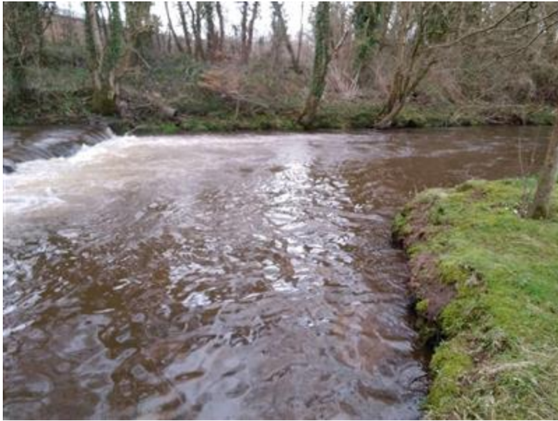
Figure 13. SN 62163 10690 DS weir from RHB.