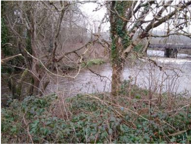
Figure 23. SN 62221 10595 Channel taken from RHB, confluence with Amman.