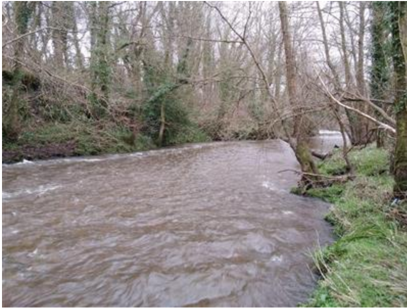
Figure 21. SN 62198 10669 Channel facing DS from RHB.