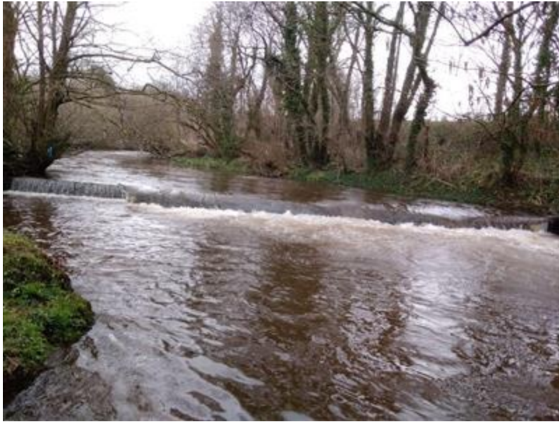
Figure 17. SN 62172 10684 Weir from DS facing US on RHB.