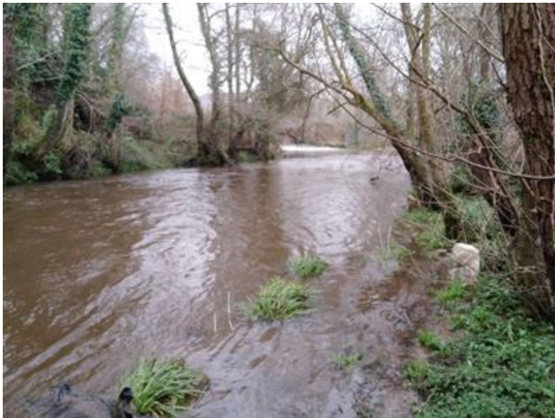
Figure 22. SN 62218 10635 Channel facing DS. River Amman enters on LHB DS in photo with weir at confluence.