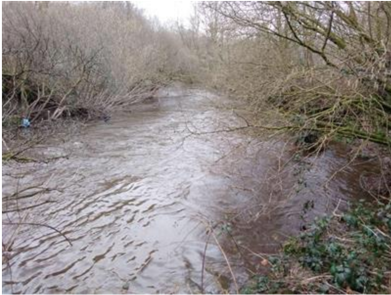
Figure 1. SN 62116 10747 View facing DS from RHB.