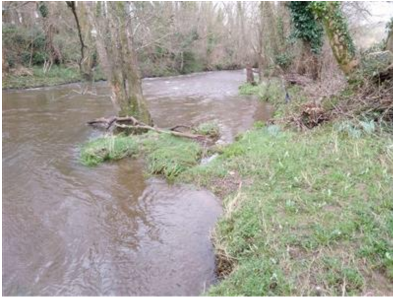
Figure 19. SN 62174 10686 RHB DS of weir, taken from RHB.