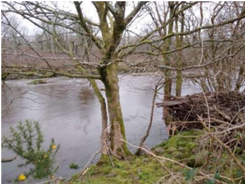
Figure 24. SN 62210 10585 Channel taken from RHB facing DS.