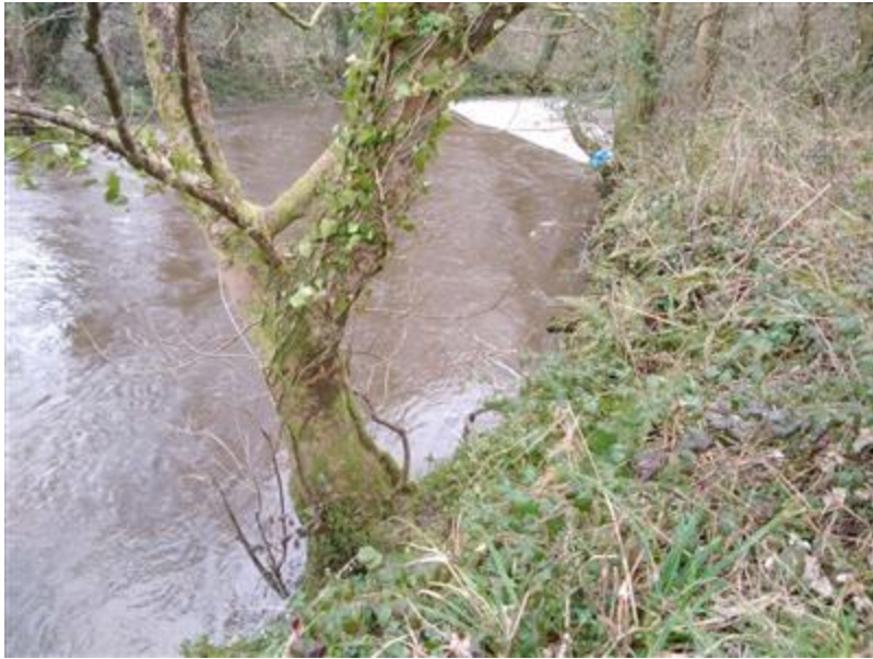
Figure 9. SN 62148 10699 RHB above weir. Taken from RHB facing DS.