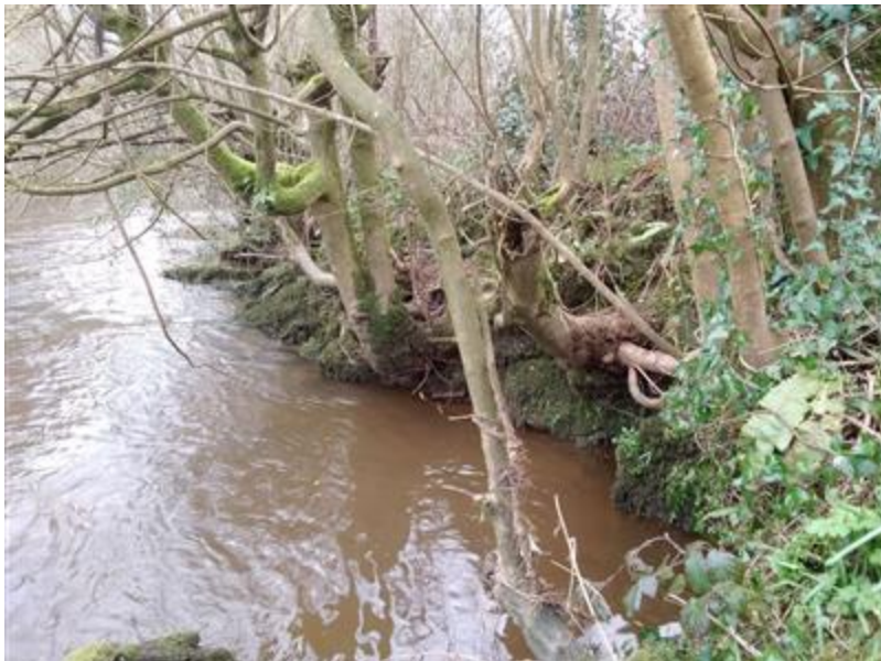
Figure 6. SN 62107 10729 Example bank type - RHB.