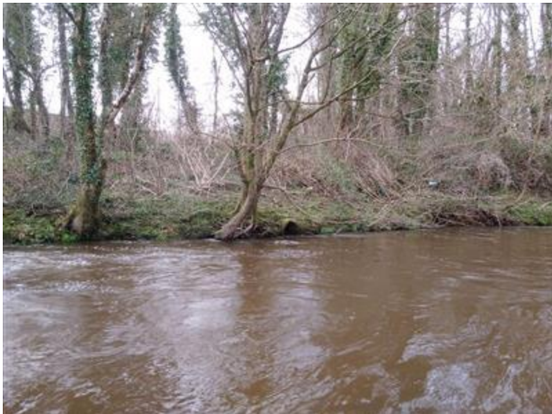
Figure 18. SN 62174 10686 LHB DS of weir, taken from RHB.