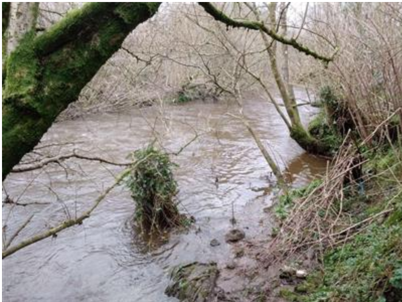
Figure 4. SN 62114 10741 Channel facing DS from LHB.