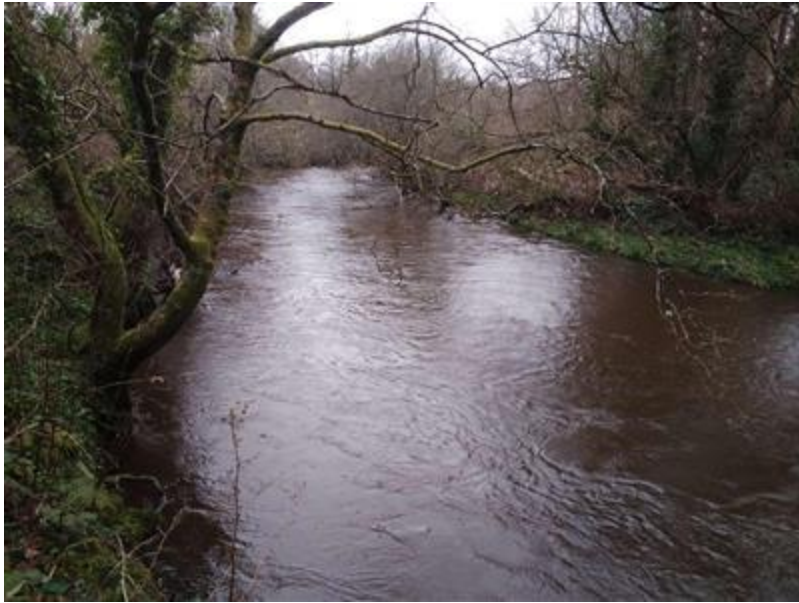
Figure 11. SN 62158 10698 Immediately US weir taken from RHB facing US.