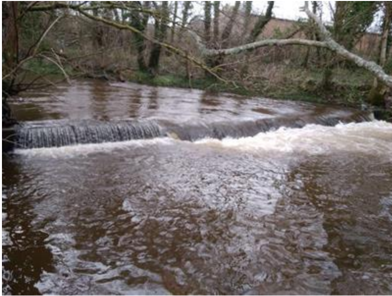
Figure 15. SN 62167 10686 DS weir facing US from RHB.