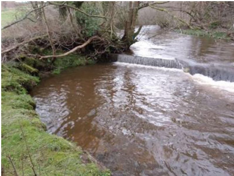
Figure 14. SN 62163 10669 Erosion DS of weir. Taken facing US from RHB.