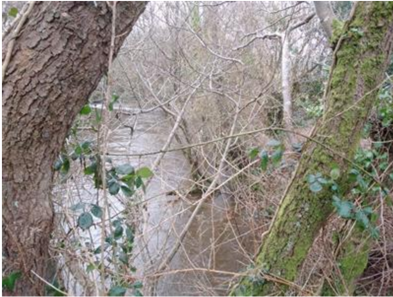
Figure 7. SN 62133 10704 RHB vegetated and heavily tree lined. Taken from RHB facing DS.