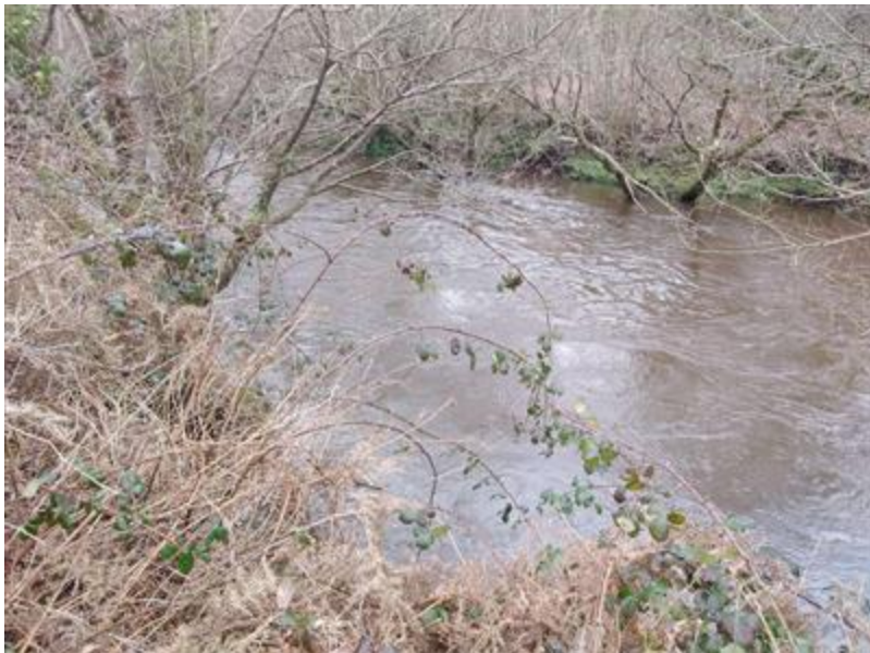
Figure 8. SN 62134 10721 US weir banks vegetated and tree lined. Taken from RHB facing US.