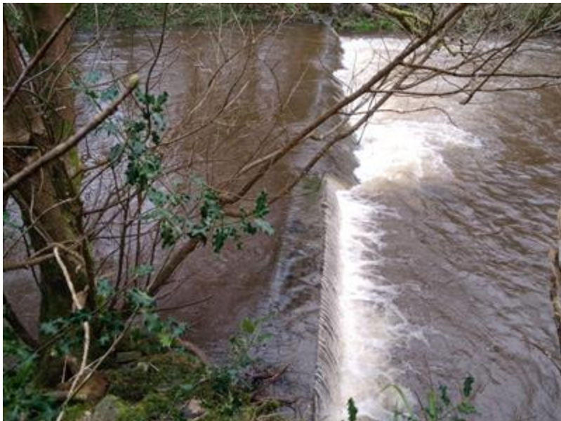
Figure 12. SN 62163 10689 Weir from RHB.