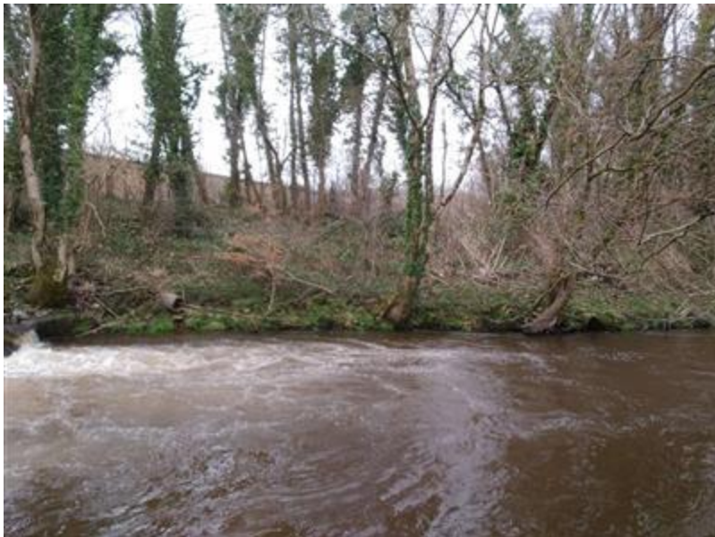
Figure 16. SN 62168 10677 LHB taken from RHB.