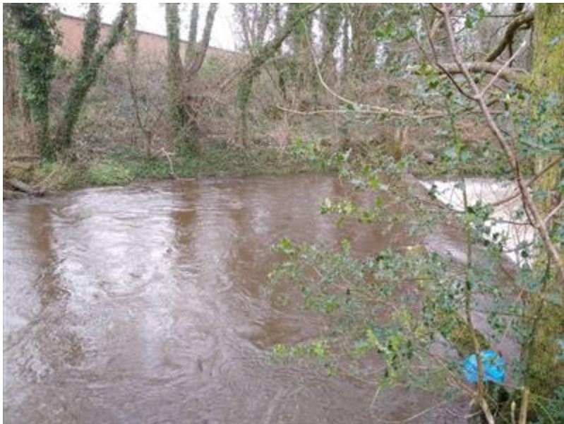
Figure 10. SN 62160 10695 LHB above weir, taken from RHB.