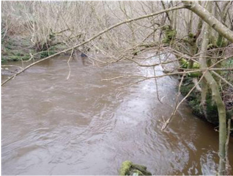
Figure 5. SN 620110 10723 Channel facing DS from RHB.