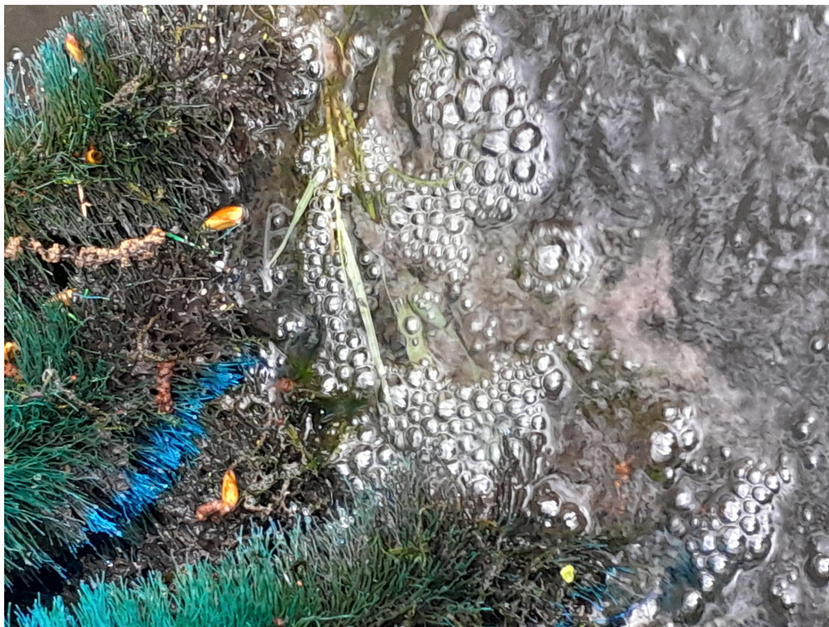
Image of final settlement tank scrubbers with evidence of sewage fungus

There was some sewage fungus near the final outfall but otherwise the site looked to be operating and maintained in line with permit guidance.