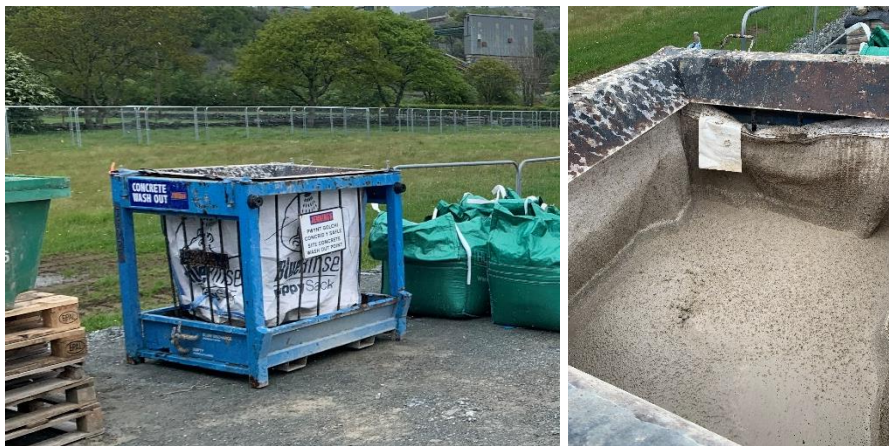
Figure B4 Concrete wash out skip at Garth site 10-05-23

A variety of concrete and grouts mixes will be used on site to construct the shaft and tunnel linings. Some of these materials will be delivered to site as a readymix material ready to be poured straight away and some will be mixed on site and pumped to where needed.