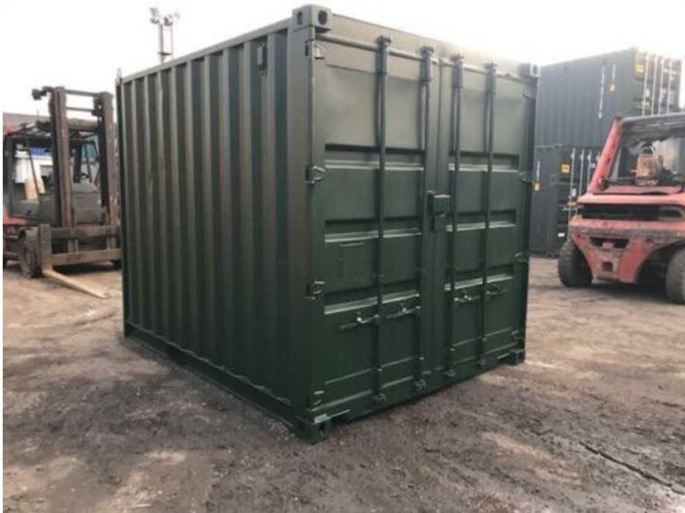
Fig. 4 Example of container that will house the SAT treatment system.