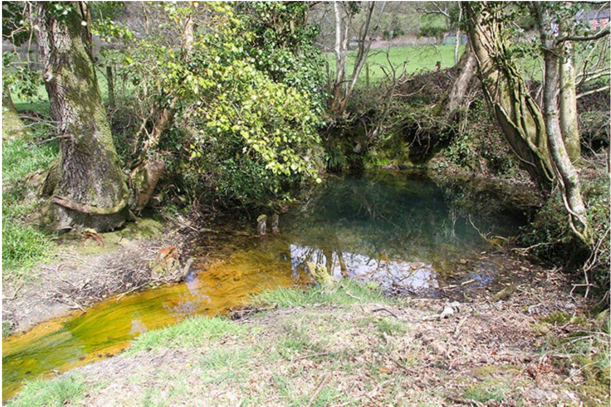
Fig. 1 Mine water discharge from the Lower Boat Level.