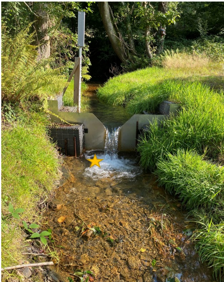
Fig. 2 Flow monitoring installation and abstraction location (yellow star)