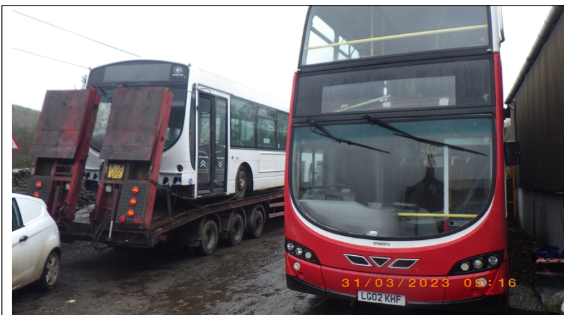
Vehicle being de-polluted