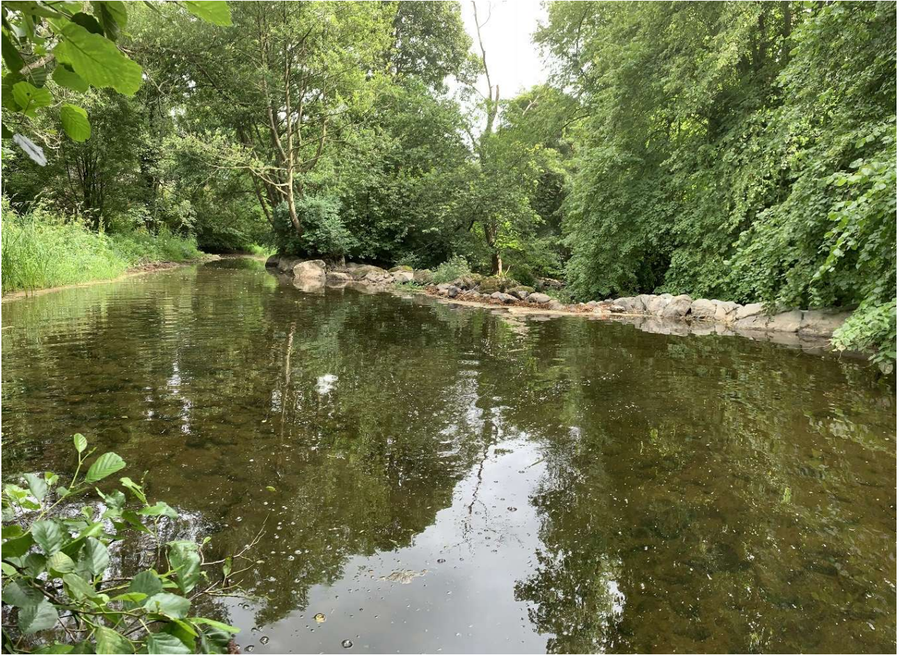
1b Weir: Downstream of the weir looking back up