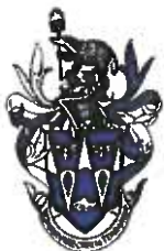
CIWM Chief Executive Officer

The Chartered Institution of Wastes Management