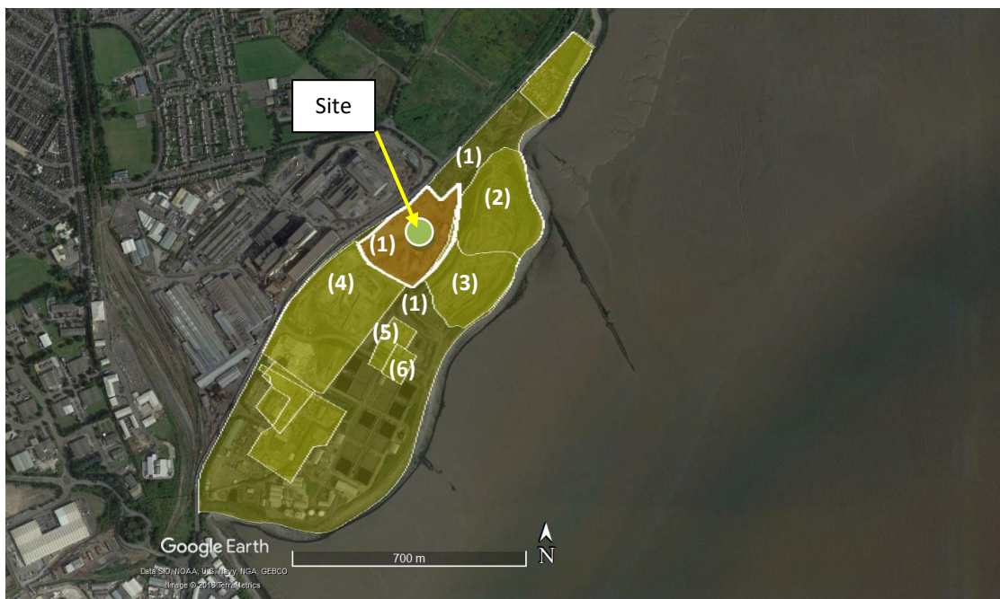
Figure 3-5: Historic landfills

The site, and all surrounding land south of Rover Way, is identified as historic landfill (of differing phases and time periods) ( Figure 3-5 ).