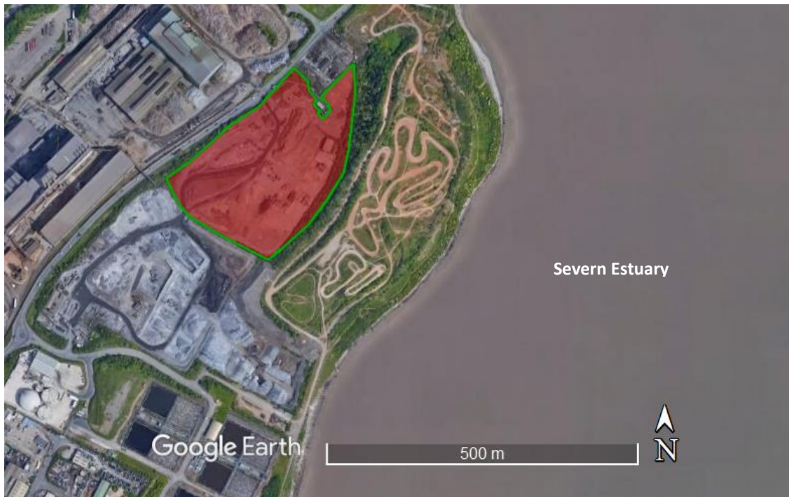
Figure 3-2: Surface water features