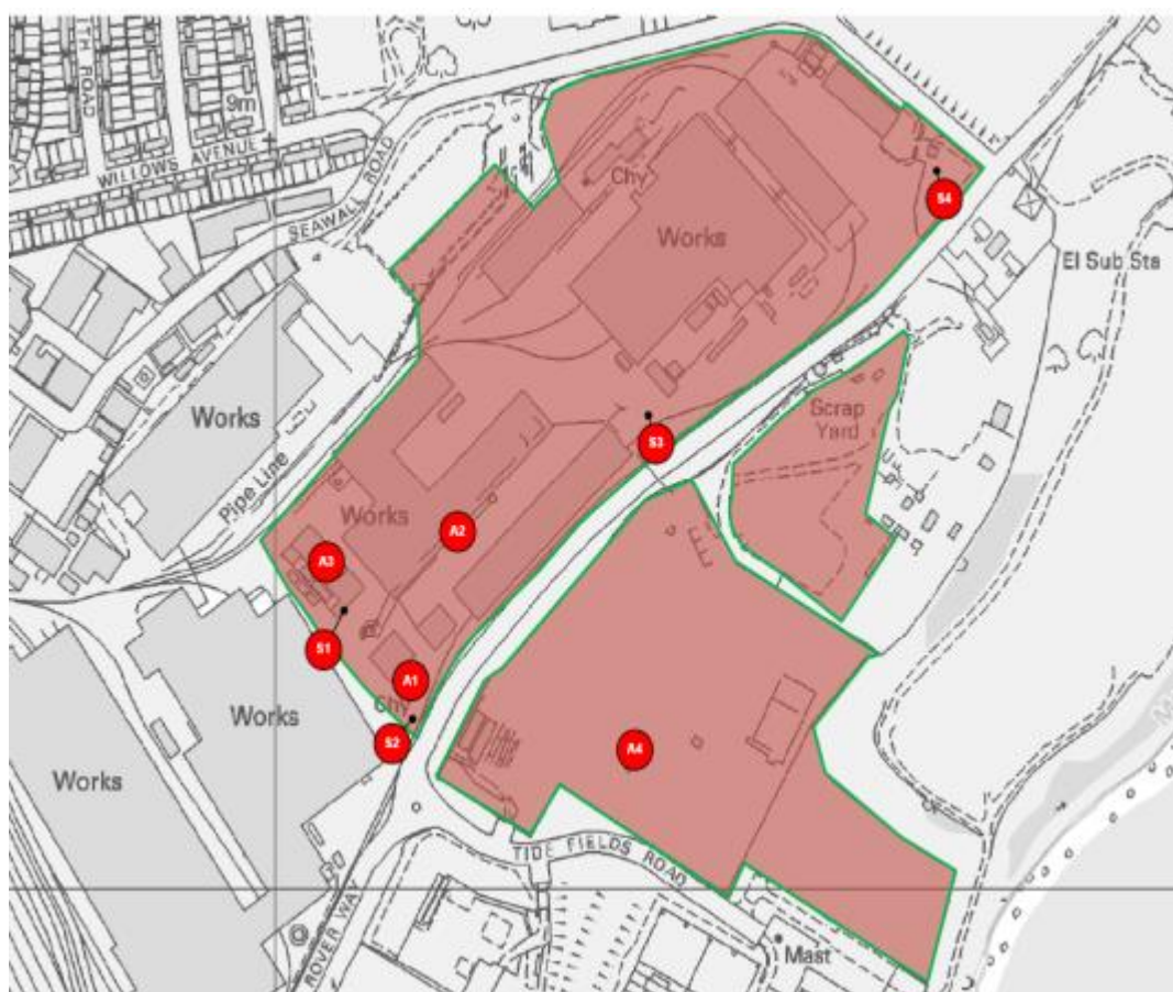
Figure 1-1: Current New Melt Shop permit boundary

An environmental permit application is required where an operator carries out certain prescribed activities, namely installations that undertake Schedule 1 activities, a waste operation or a mobile plant (carrying out either one of the Schedule 1 activity or a waste operation). The current permit boundary is outlined in Schedule 7 of the environmental permit ( Figure 1-1 )