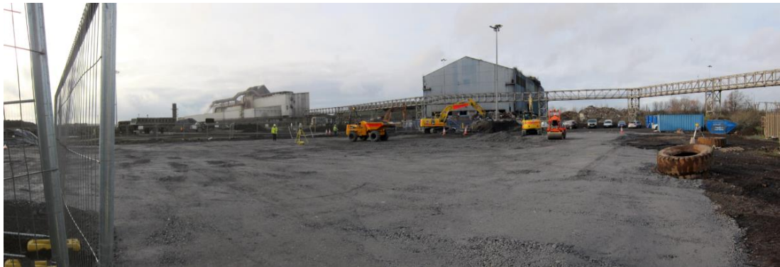
Photograph 4-1: Location on new integrated scrap centre

The activities covered by this SCR are outlined in Section 1.3 .