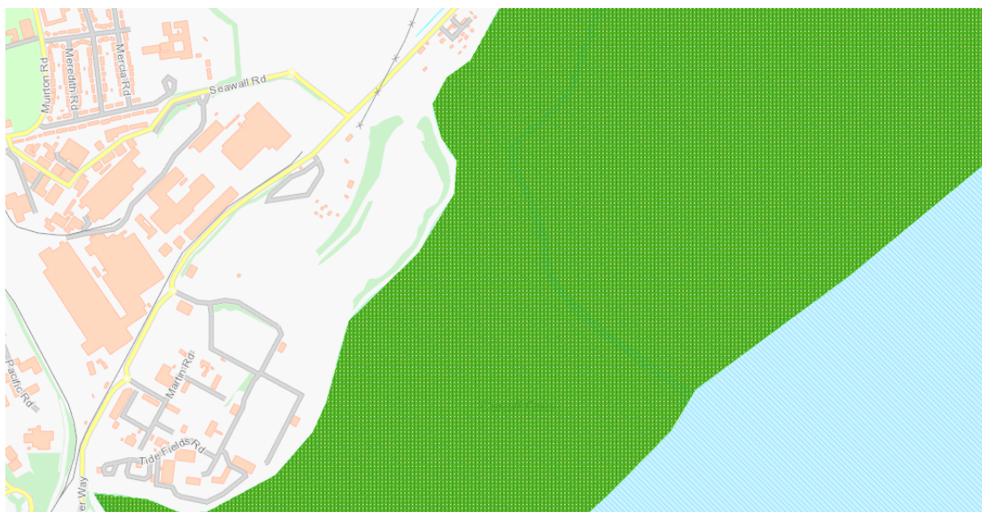
Figure 3-4: Ecology designations surrounding the site (Geoindex Onshore)

The site is adjacent (within 250 metres) of the Severn Estuary which is designated a Ramsar Site, Special Area of Conservation (SAC), Special Protection Area (SPA) and a Site of Special Scientific Interest (SSSI) (Figure 3-4).