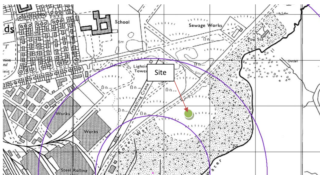
Figure 3-6: Ordnance survey 1:10,000 (1975)

From the earliest map of 1880 the site comprised of mud flats. By the mid to late 1960s the site had been reclaimed with waste materials (which from anecdotal information the reclamation materials are known to have comprised slag and other steel manufacturing waste materials from the surrounding steel manufacturing works and comprised mainly blast furnace slag); the site, and immediate surrounding area, which had also been reclaimed, is annotated on historical maps as being a 'disused tip'. The site since it was reclaimed has remained undeveloped to the present day.