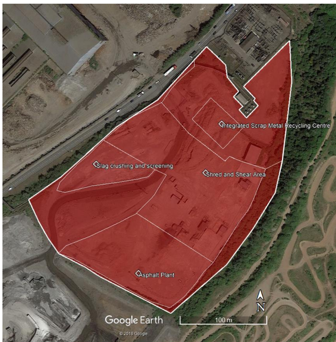
Figure 1-2: Site Condition Report (scope and extent)