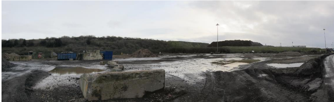
Photograph 4-2: Location of new shred, shear and asphalt plant