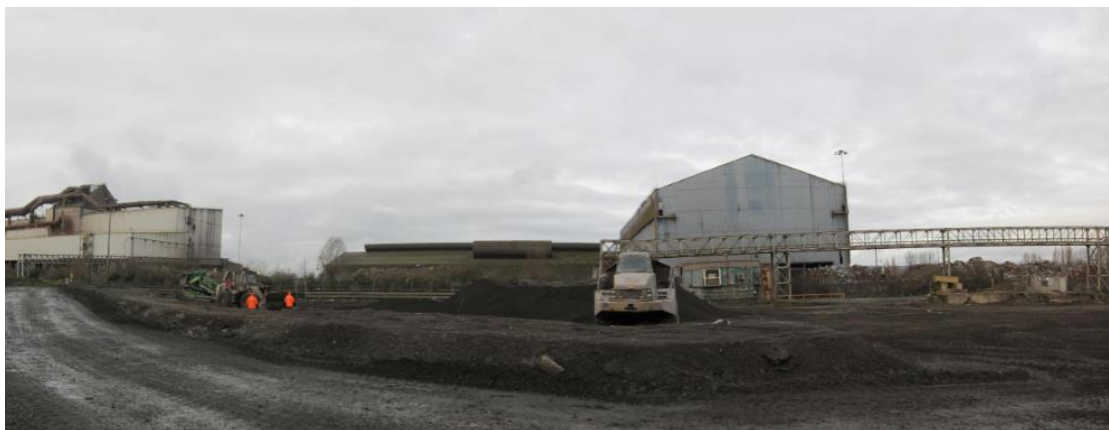
Photograph 4-3: Location of new slag crushing and screening area