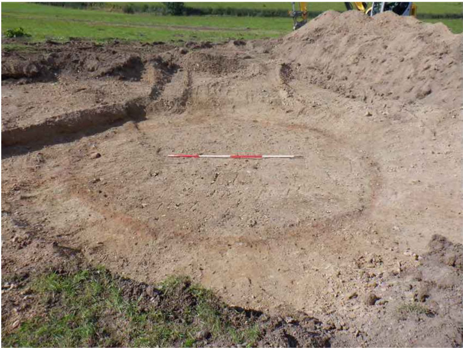
Feature [5003] fully exposed - Trench 5