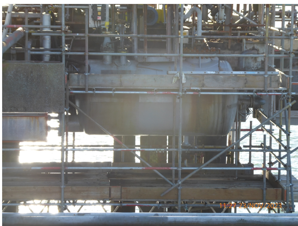
Berth 5 slop tank during site visit

A report of a loss of oily water to Milford Haven Waterway was received from the operator on 17 November. On the morning of 17 November, a small oil sheen was observed on the surface of the Haven around Berth 5. The source was identified as a weep of oily water from a flange on the Berth 5 slop tank. In response to the incident, the operator deployed absorbent pads around the leak and removed oily water from the surrounding scaffolding. The operator informed the Milford Haven Port Authority, who deployed a pilot boat to assess the extent of the sheen. By 10:30 the sheen was reported to have dispersed.