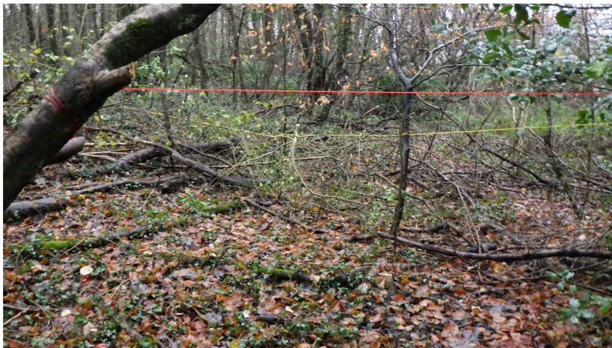
Figure 2: Site visit photo – Ropes tied between trees acting as a barrier/screen.

However, several obstructions were encountered on route to the sampling/discharge point including a roped cordon with branches placed on them to create a barrier/screen as well as a tarpaulin tied between two trees along the access route. This is evidence in Figures 2 and 3, respectively.