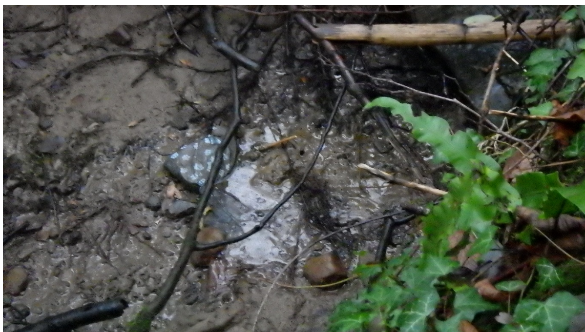
Figure 5: Site visit photo – The discharge observed at the time of the visit. As seen, it appears clear but no sample taken due to insufficient amount of discharge.

On arriving at the permitted sample/discharge point it was noted that access was slightly hindered by overgrown vegetation but not to the extent that observing or taking a sample would be significantly difficult/unfeasible. There was a clear view of the discharge point, as seen in Figure 4, with a small amount of discharge at the time of the visit, but not significant.