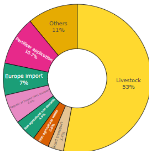
Figure 1: The source attributions of nitrogen deposition at Brampton Bryan park from both combined sources and local sources.

Local contributions to Nitrogen deposition (KgN/ha/yr) from sources (UK)