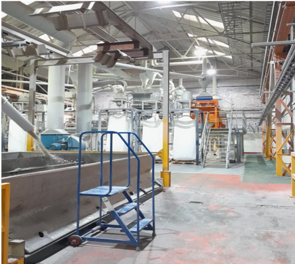
Image 1 - Picture showing the factory floor clean and tidy