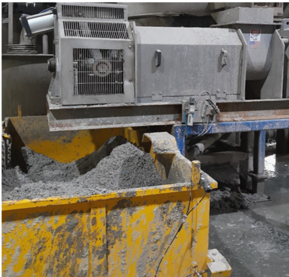
Image 2 - Showing the de-watering screw operating to full capacity

On inspecting the grounds outside it was good to see that the filters on the drains were not as congested as the last visit, they are now checked daily and then deep cleaned weekly. It was good to see this improvement. Please continue to ensure that the drains are kept clear from debris and litter.