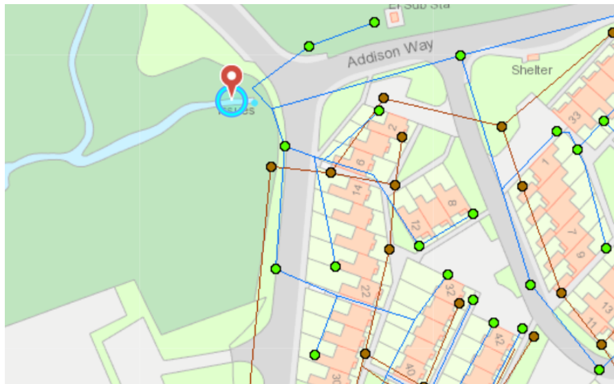
Fig 1. Surface discharge point (ST1920889092)