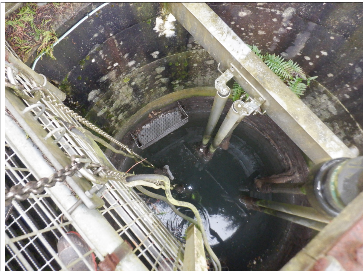
Figure 3 Storm tank with screen

There is a storm overflow at the inlet that discharges to the storm tank. There was plenty of storage capacity in the tank at the time of the visit. There is a screen on the outlet from the storm tank, the screen is open on the top and is manually cleaned by operatives with a telescopic brush. The screen is prone to becoming clogged and allowing solids and rags to flow out of the tank in times of high flows.