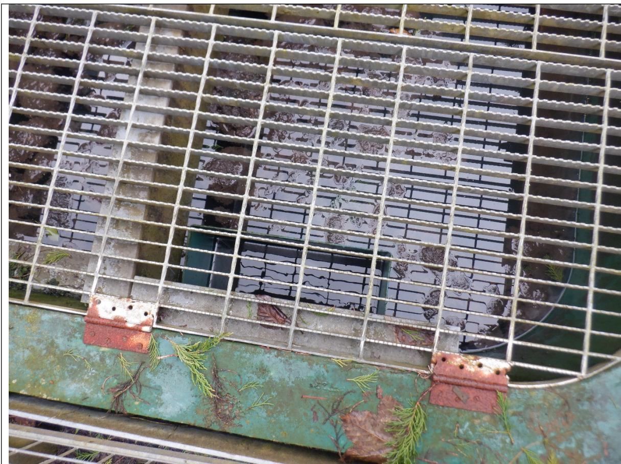
Figure 2: Final settlement tank with lots of solids present on the surface, the rising sludge is skimmed quarterly.