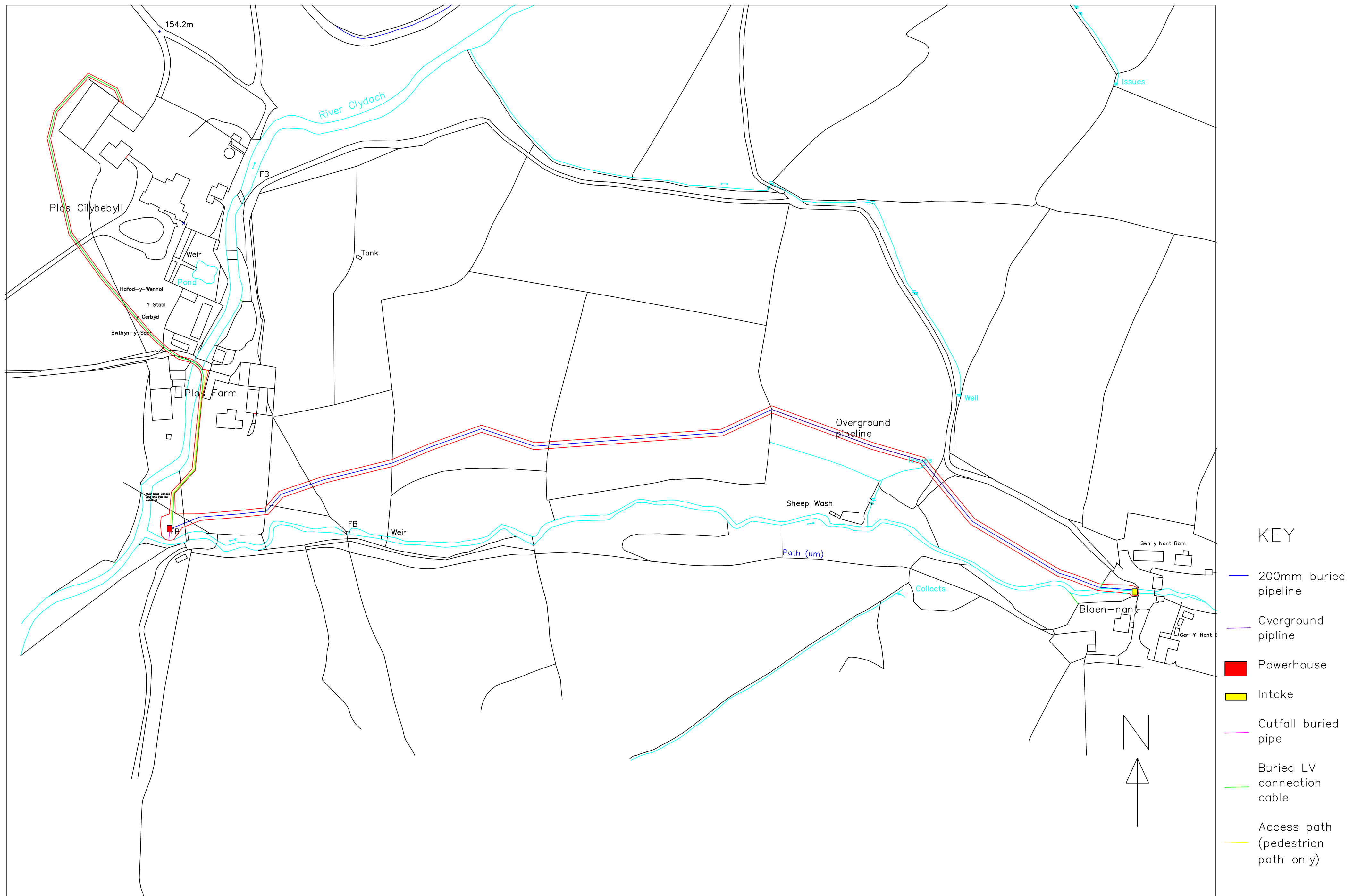
Plas Farm Hydro General Layout RevA