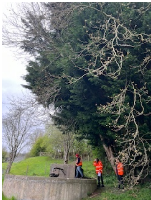
Image 3, trees growing above works.

There was evidence that the pine trees growing over the works in times of high wind deposit branches on the filter bed which could impact the works, it is advised the trees are cut back as much as possible to prevent any branches falling on the asset which could impact treatment operations.