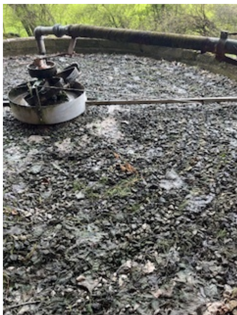
Image 2, filter bed with debris

There was a small amount of debris settled on the filter bed. This type of site has no inlet screen, meaning debris can settle on the filter bed. This should be cleaned off by the site operator when the site is visited weekly.