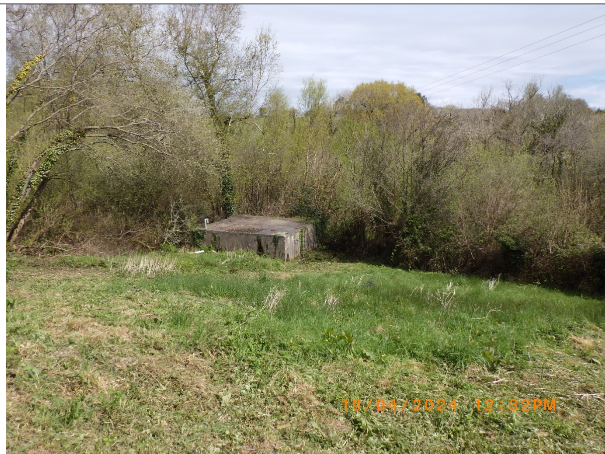
Figure 1: Point of abstraction