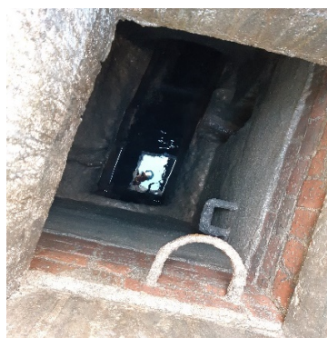
Figure 6: View of discharge prior to reaching consent point