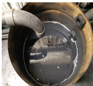
Figure 4: Sample point