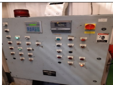
Figure 3: Alarm panel with pH reading