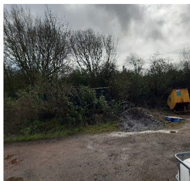
Figure 5: Access issue to consent point