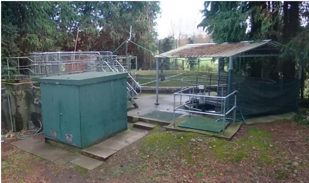
Photo of current assets on site and surrounding space remaining. And GIS and Areal image of WwTW, of DCWW's existing landholding. Demonstrating there is no further room to expand without further land purchase, considering boarder of mature trees surrounding the existing perimeter.