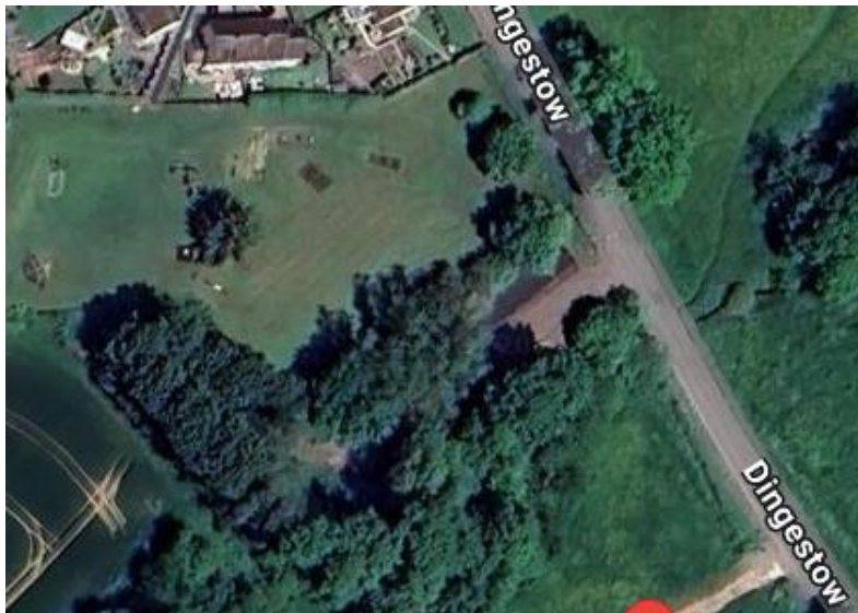
Photo of current assets on site and surrounding space remaining. And GIS and Areal image of WwTW, of DCWW's existing landholding. Demonstrating there is no further room to expand without further land purchase, considering boarder of mature trees surrounding the existing perimeter.