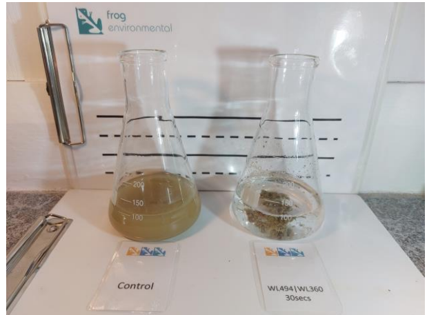
B. Test 2 Control vs WL 494 / 360 (further 15 second agitation from Test 1 plus 60 seconds settlement)