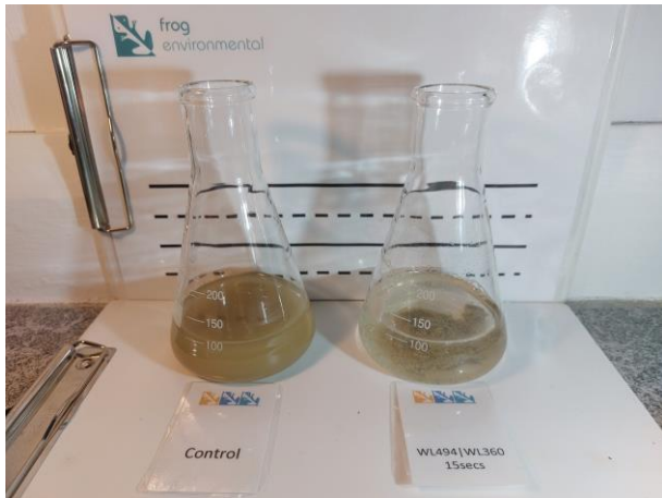
A. Test 1 Control vs WL 494 / 360 (15 seconds agitation plus 30 seconds settlement)