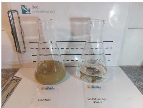
C. Test 3 Control vs WL 494 / 360 (further 15 second agitation from Test 2 plus 60 second settlement)