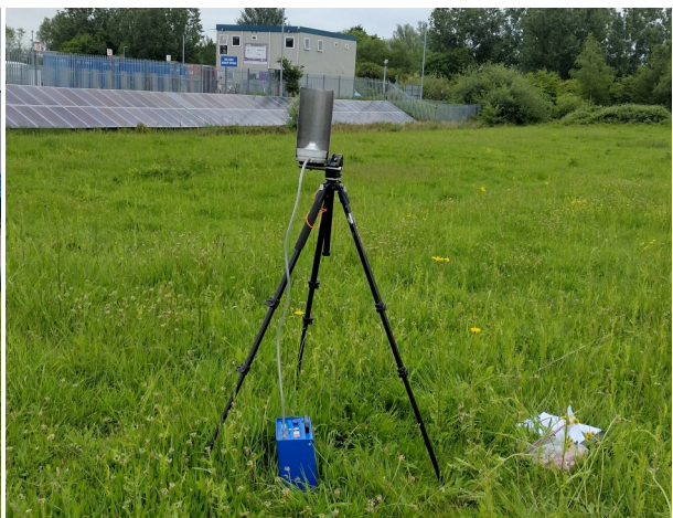
Sensitive Receptor 003 location looking away from site