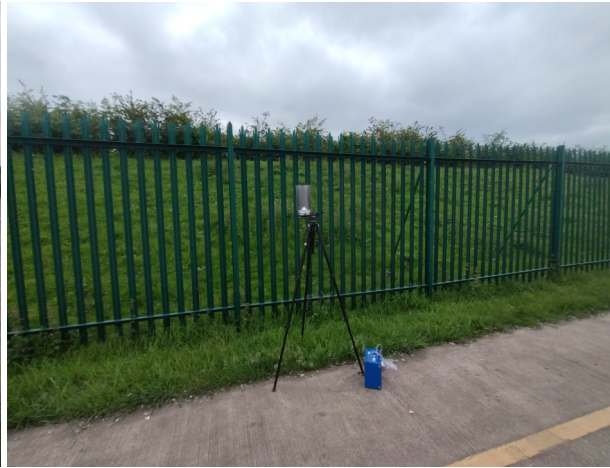
Upwind 001 location looking away from site