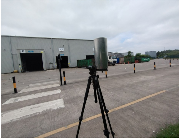
Upwind 001 location looking towards site