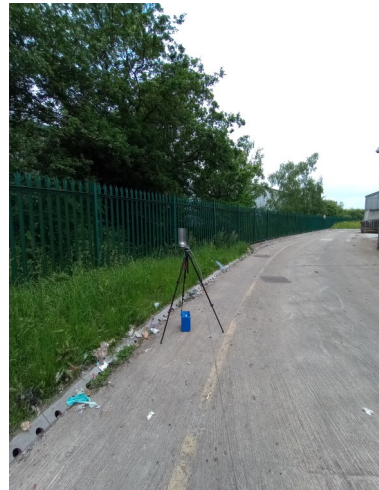
Downwind 002 location looking away from site