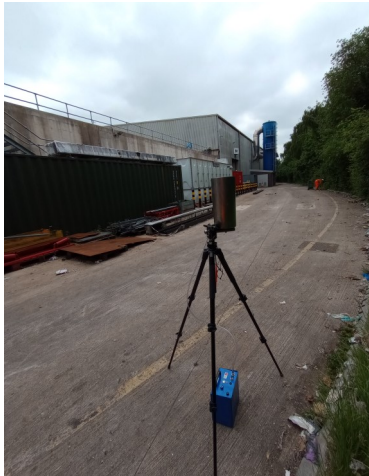
Downwind 002 location looking towards site