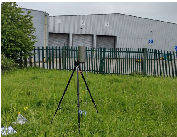
Sensitive Receptor 003 location looking towards site