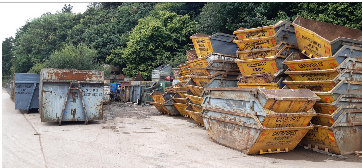
Photo 6 - On site waste transfer activities on the 'bottom yard'