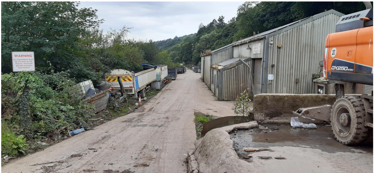
Photo 5 - On site waste transfer activities on the 'bottom yard'