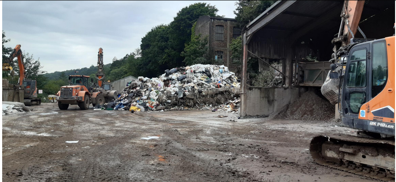
Photo 2 - On site waste transfer activities on the 'top yard'