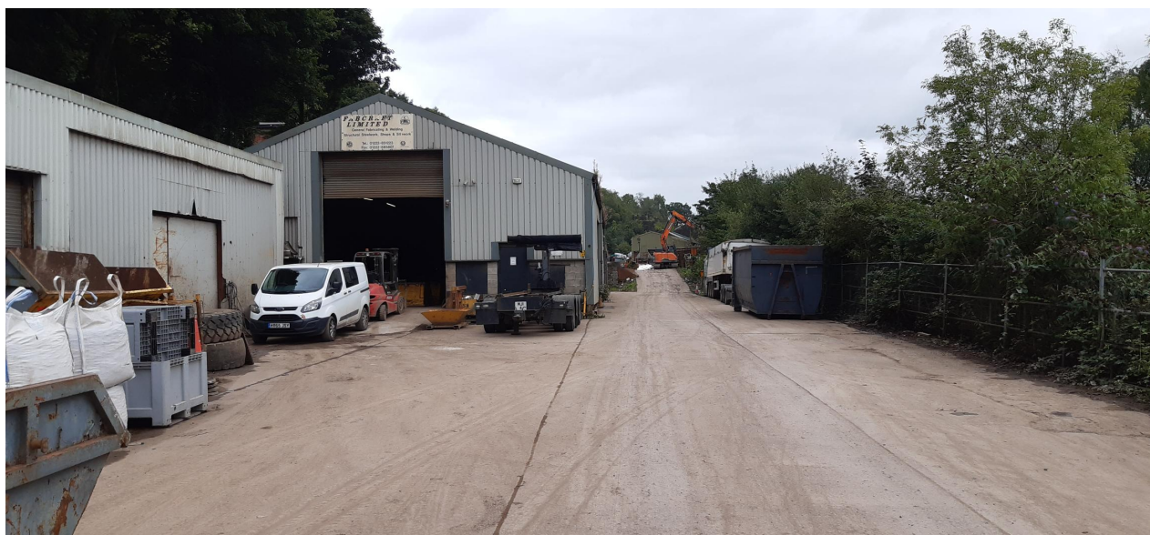
Photo 7 - On site waste transfer activities on the 'bottom yard'