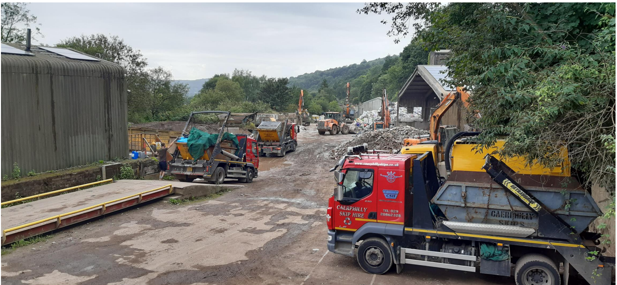
Photo 3 - On site waste transfer activities on the 'top yard'