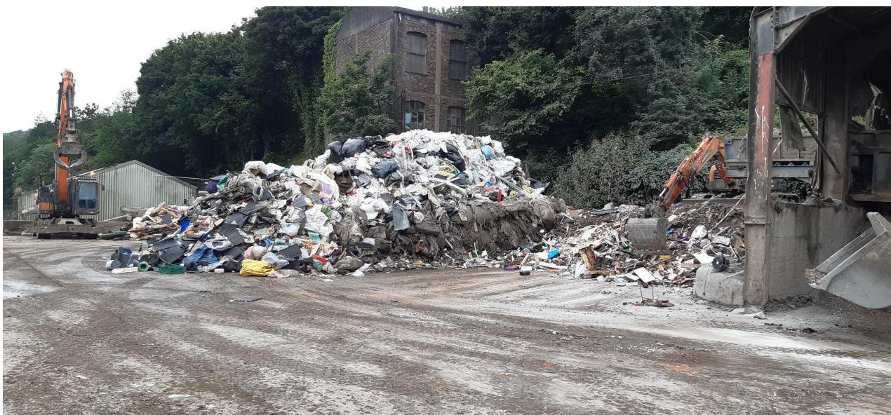
Photo 1 - On site waste transfer activities on the 'top yard'

NRW Officers, were satisfied at the time of the inspection, that the current mitigation / prevention measures were in place with no concerns raised. The site were reminded, as previously stated, to abide by their Environmental Management System at all times especially when it comes to emissions (I.E. odour / noise / dust etc) to prevent and mitigate as practical as possible.