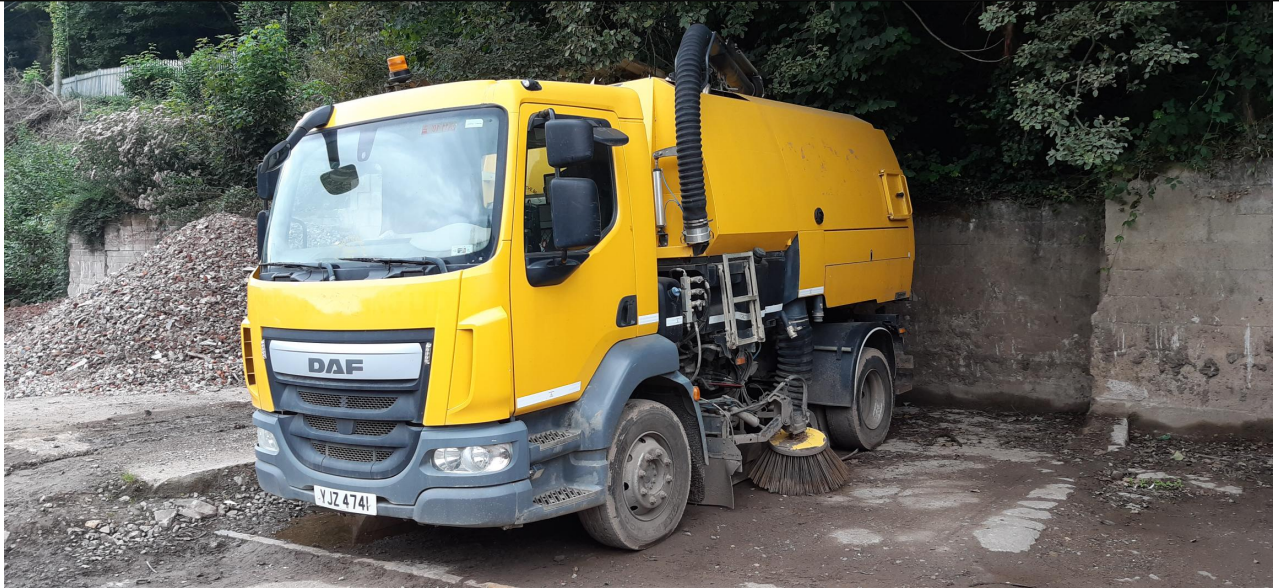
Photo 4 - On site road sweeper at CWS Ltd.