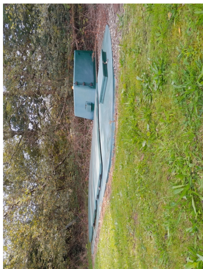
Sewage Treatment Plant (Fig 2)