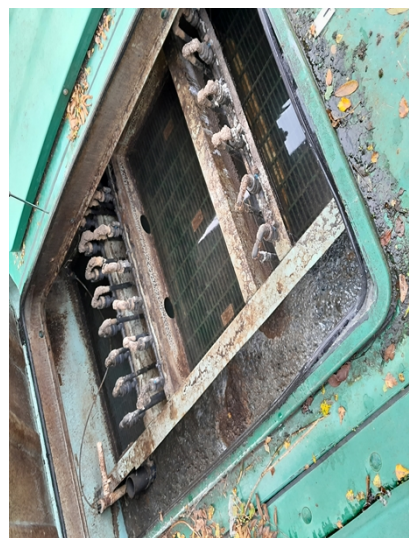
Second Chamber (Fig 4)

I lifted the lid on the third chamber. The amount of solids carry over was again reduced. Please see Fig 4 below.