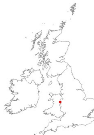
Location of Montgomery Canal SAC/SCI/cSAC

Natura 2000 standard data form for this site as submitted to Europe (PDF, < 100kb).