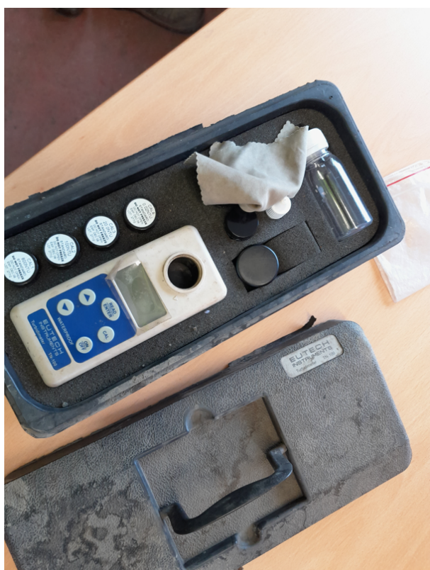
Photograph 2: EUTECH TN-100 Turbidimeter Used for Analysis

On 09/10/2024 myself and a senior NRW officer conducted a site visit with a mines restoration consultant for Hargreaves Minerals at Tower Colliery. As part of the visit we discussed the anomalous result. The consultant stated that he was unaware of any calibration of the turbidimeter since it had been used at the site. No calibration certification was present with the instrument (photograph 2).