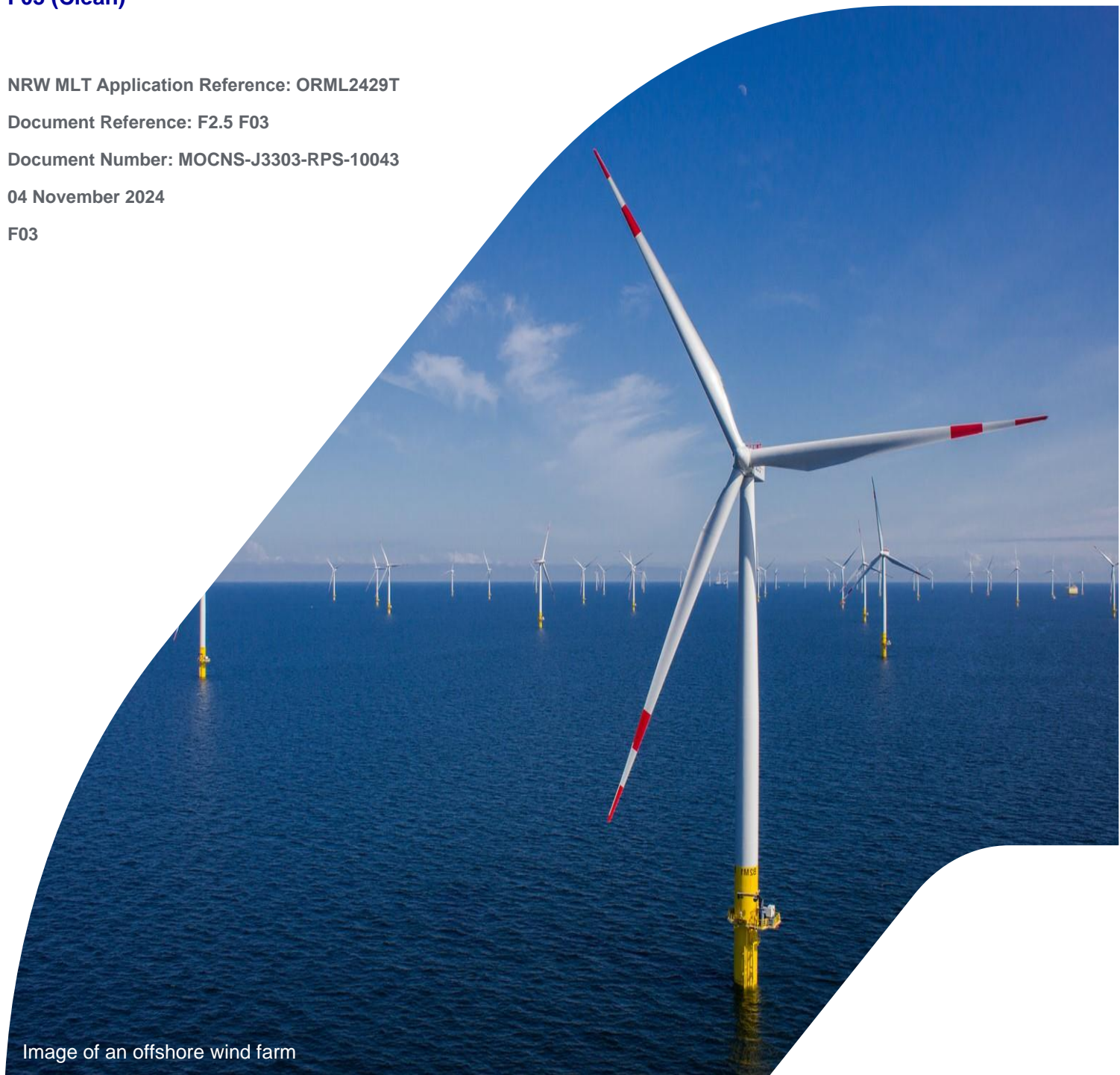
Image of an offshore wind farm