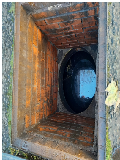
(Fig 4.) Secondary Interceptor Chamber.

We lifted the cover on the tertiary interceptor chamber. There were no visible signs of oil within the chamber. There were no signs of car shampoo within this chamber . Please see Fig 5. below