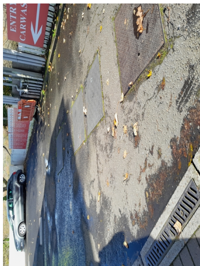
Fig 2. (overview of site)