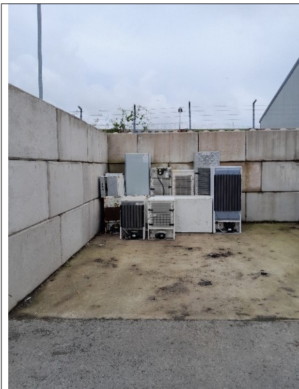
Image 1 - Storage of WEEE without a roof/covering