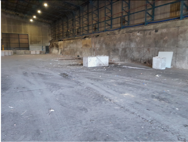
for Unit 41: