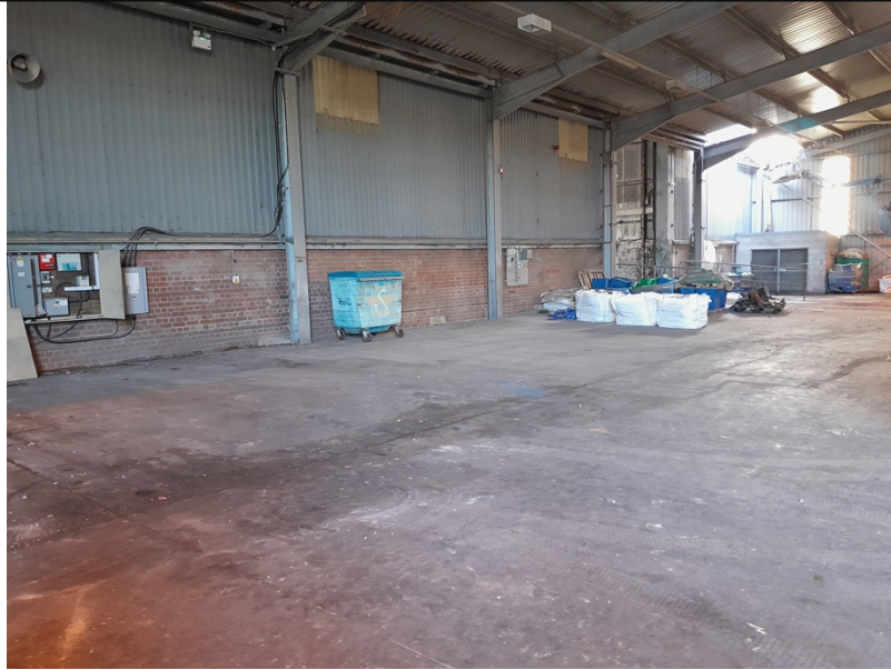
Unit 41 - pre-sweep & removal of blocks