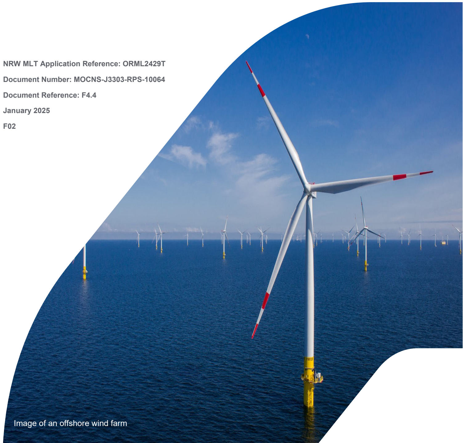
Image of an offshore wind farm