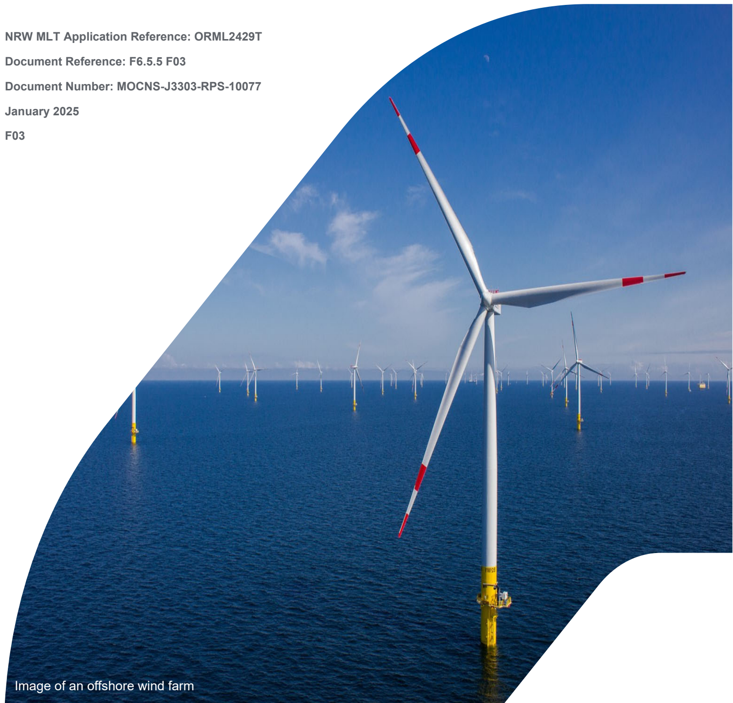
Image of an offshore wind farm