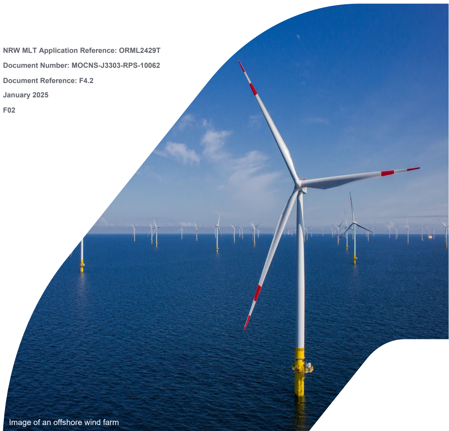
Image of an offshore wind farm