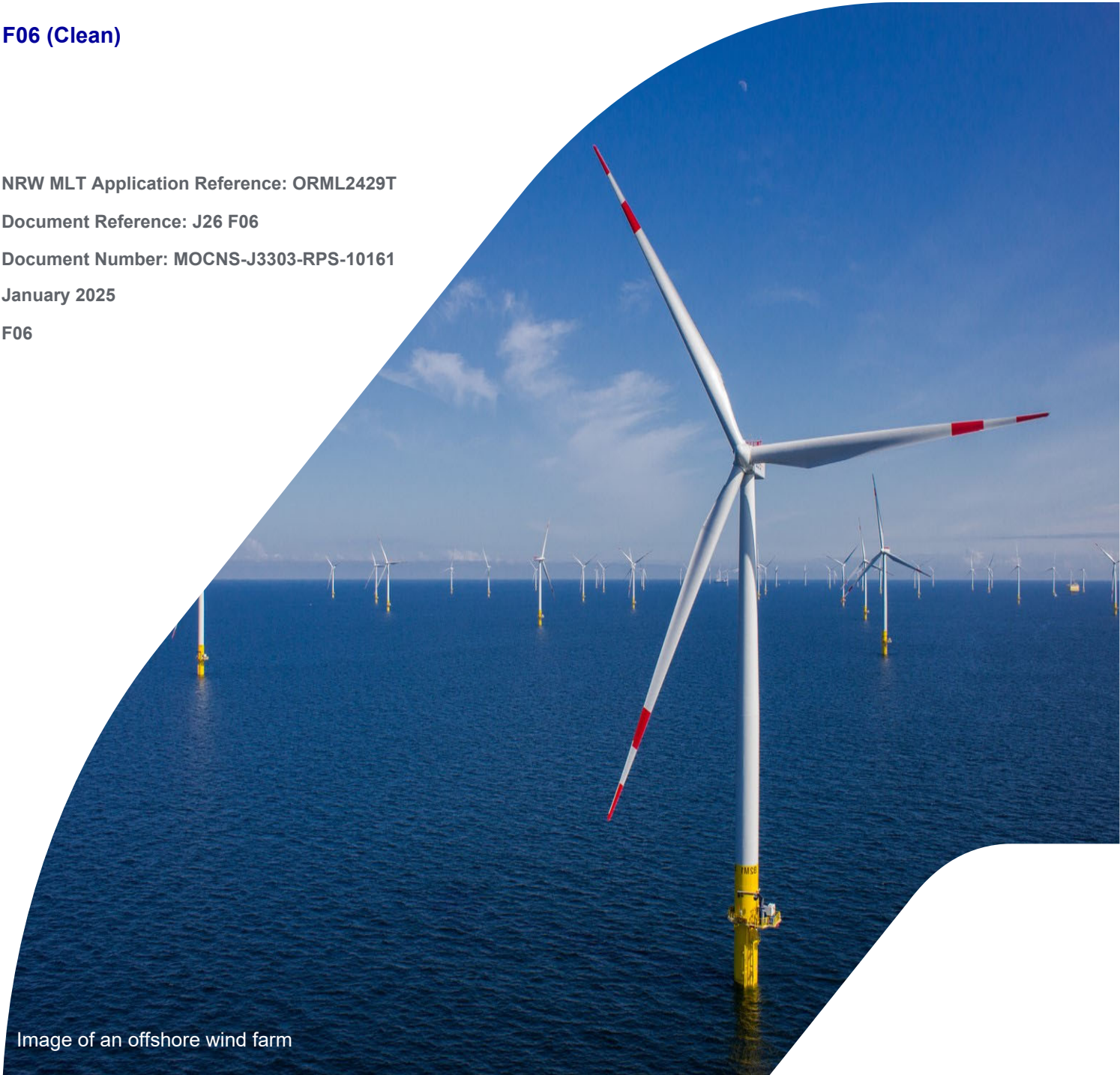
Image of an offshore wind farm