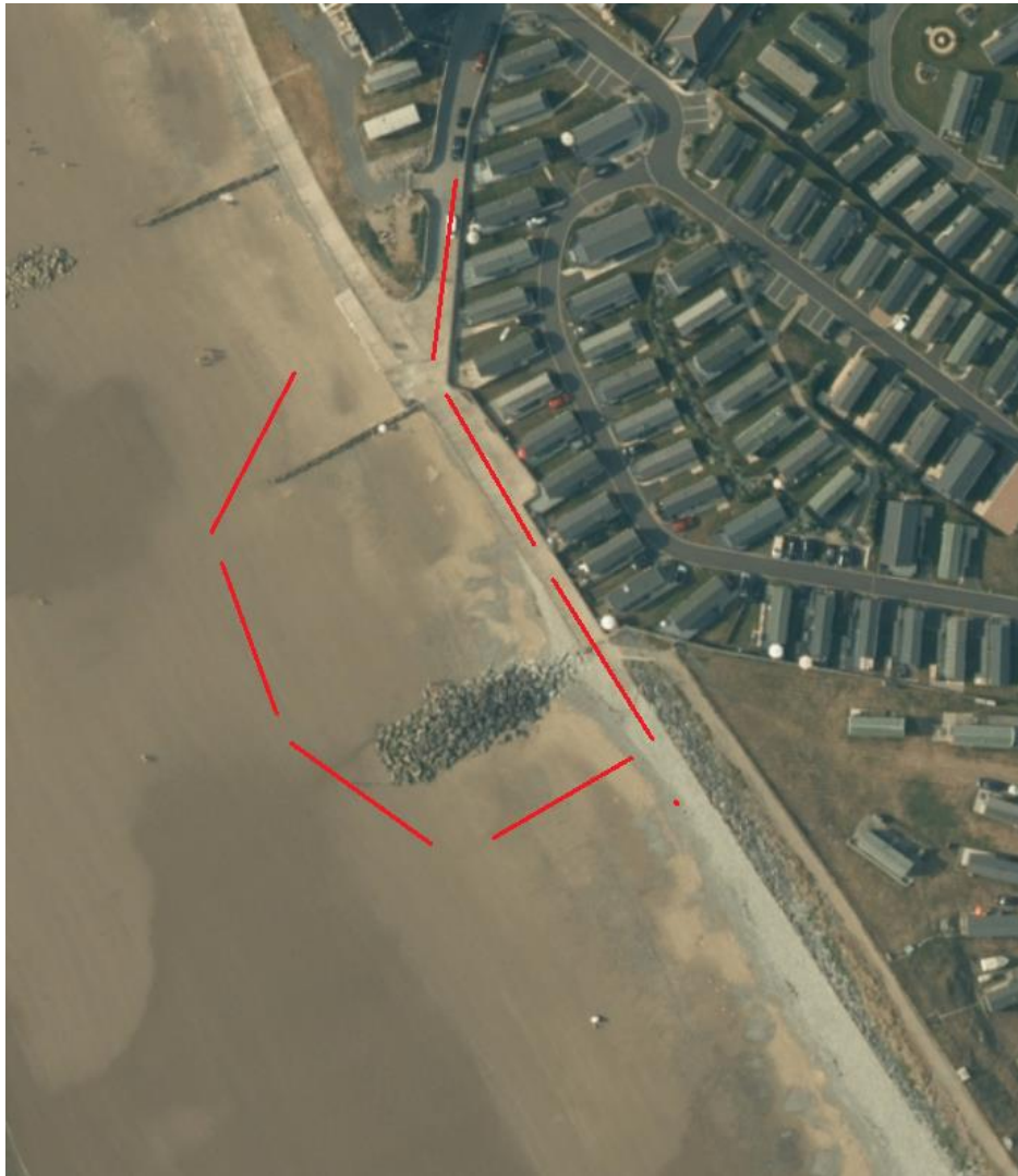
Figure 2: Proposed access route from Neptune Road towards beach level

Plant access to beach level from the direction of Neptune Road will be via the access slip at the southern end of the promenade and the around the seaward side of the two southern most groyne structures (see figure 2 below). Some temporary and local re-profiling of the shingle bank may be necessary to provide adequate access from the promenade and then down to beach level.