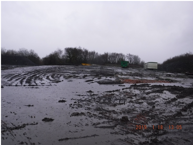
Track leading north east of office to second open yard area