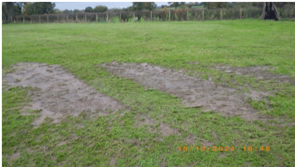
Photograph showing waste within field 6.

During the inspection officers identified that waste material had been spread to field 6 also, as shown in the photograph below. There was no record of any spreading activity taking place within field 6 on the spreading records provided by the company. It is therefore deemed that accurate spreading records have not been kept/provided.