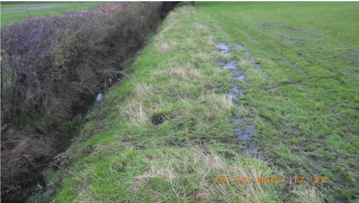
Photograph showing waste spread in close proximity to the drainage ditch in field 5. Pathway can be seen where waste has run-off into drainage ditch.