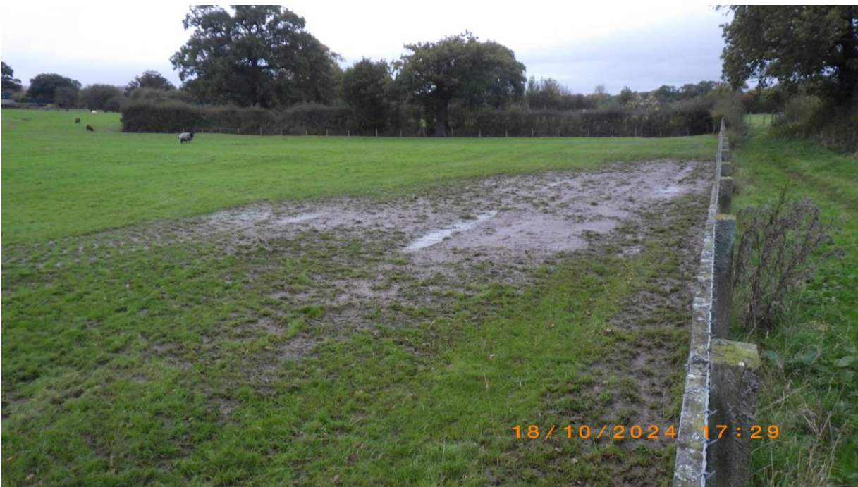
Waste seen pooling within field 4