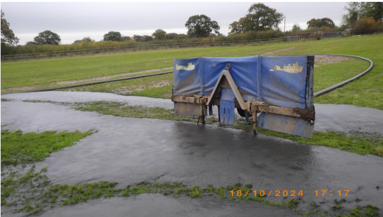
Waste pooled thickly around spreading equipment in field 5