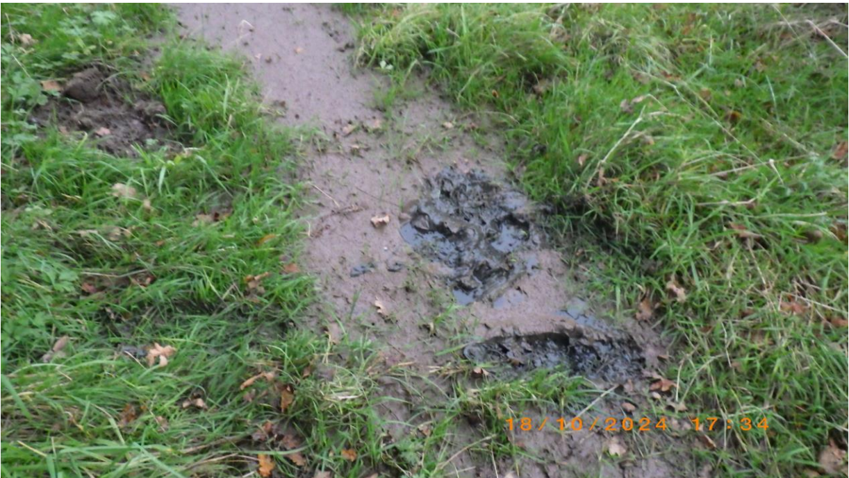
Waste on track adjacent to field 5 of the deployment (outside of deployment area)