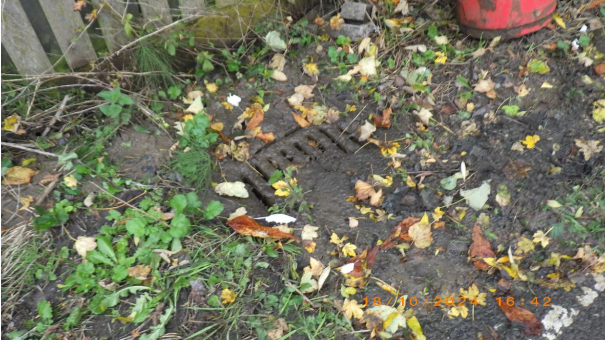
Waste identified as having run into road drain near field entrance

up email was sent to make them aware of the incident and request a clean-up of the ditch and the road drain. The permit holder confirmed on 21/10/2024 that this had taken place. Copies of waste transfer notes for the deployment were requested. These were provided on 07/11/2024.