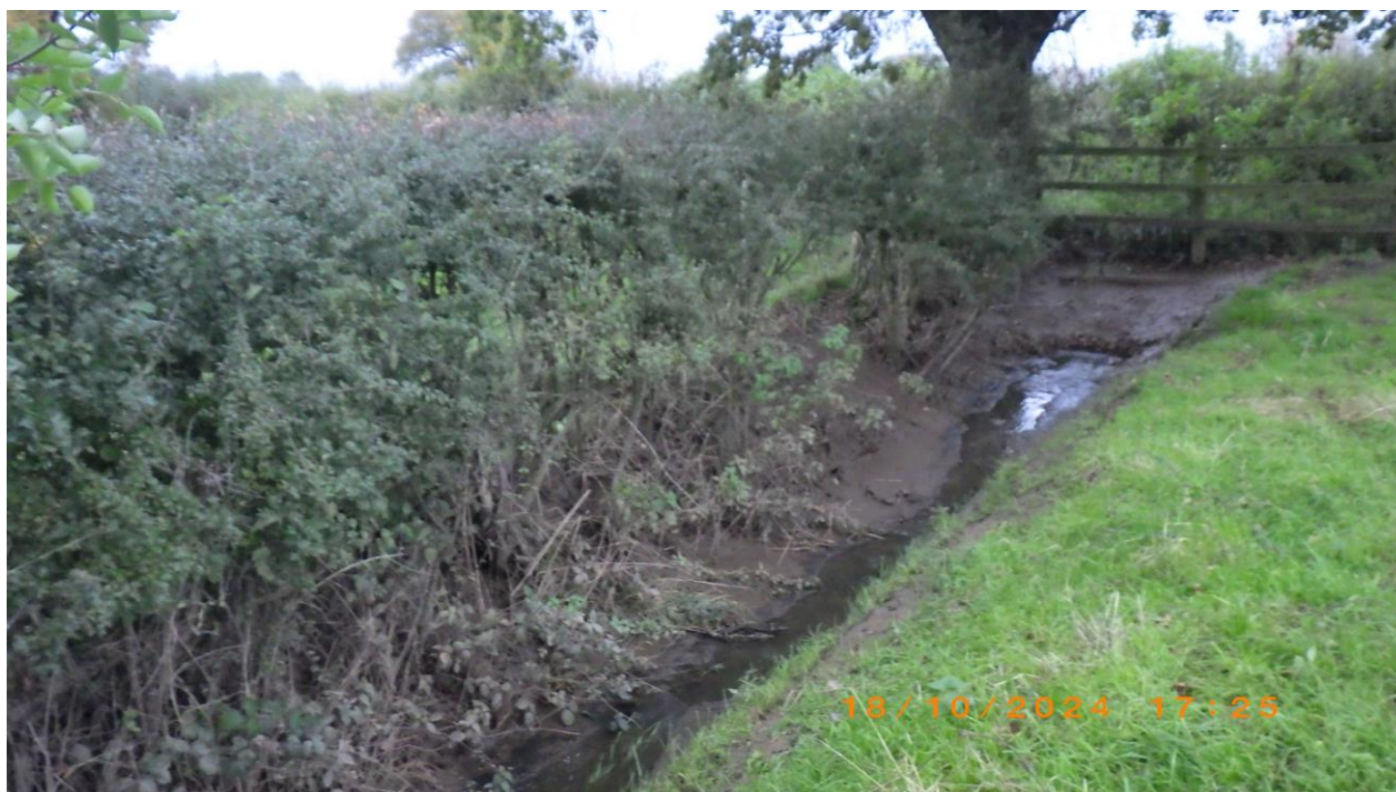
Waste within the ditch in field 5

As a result of this site inspection the following permit breaches have been identified.