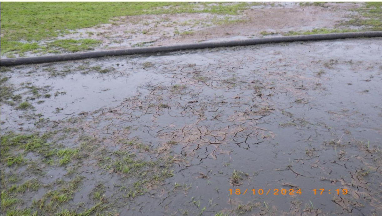
Area where waste had pooled within field 5 of the deployment