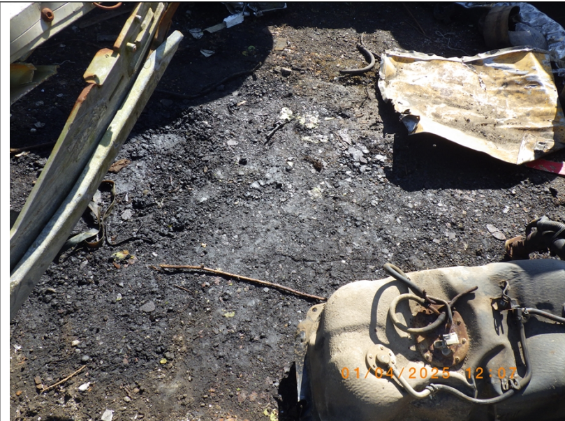
Image 1 - One of several oil spills on hardstanding area identified during the inspection.

A large volume of oil was identified on the impermeable surface used to store engine oils which was yet to be cleared. Although the depollution process was not witnessed during the inspection, it is a requirement under condition 2.5.1 for the removal and separate collection and storage of fuel, motor oil, transmission oil, gearbox oil, hydraulic oil, cooling liquids, antifreeze, brake fluids, air-conditioning system fluids and any other fluid contained in the end-of-life vehicle.