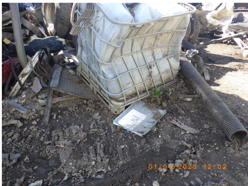
Image 4 - IBC containing waste oils stored on an area of hardstanding with no containment

An IBC that the operator confirmed on site containing oils (approximately 1/3 full) was stored on the area of hardstanding, with no containment measures in place.