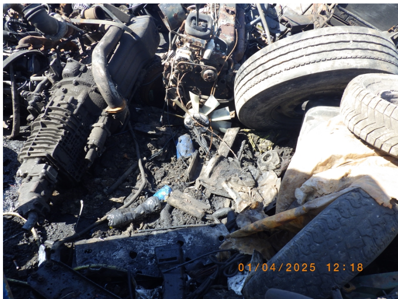
Image 6 - Oil spill identified on impermeable surface for engine storage.

Condition 2.5.1 set the minimum standard for ELV depollution. During the inspection a significant volume of oils were present under the depolluted engines. The depollution process was not observed during this inspection, however, given the volume of oil identified, please ensure that the minimum technical requirements are met as outlined in the permit.