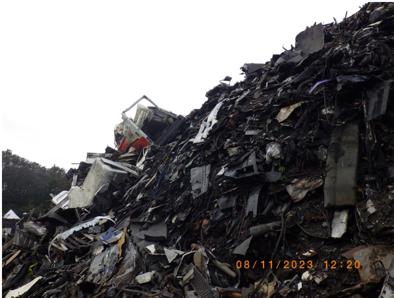
Image 2 - waste stockpile stored at rear of main building identified on 08/11/2023.