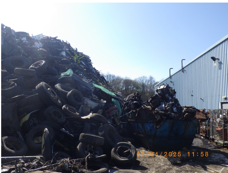
Image 3 - waste stockpile stored at rear of main building 01/04/25.

Under the above condition, wastes shall be stored for no longer than 1 year prior to disposal and 3 years prior to recovery. The storage of these wastes have been raised at inspections on several occasions, with no visible decrease in the quantity of waste being stored on the impermeable surface in this area.