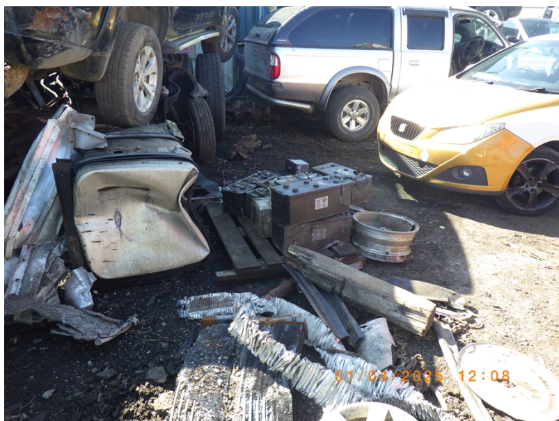
Image 5 - Storage of batteries on wooden pallet on hardstanding.

Officers identified several batteries stored outside, stored directly on hardstanding or on a wooden pallet on the hardstanding as shown in the image below.